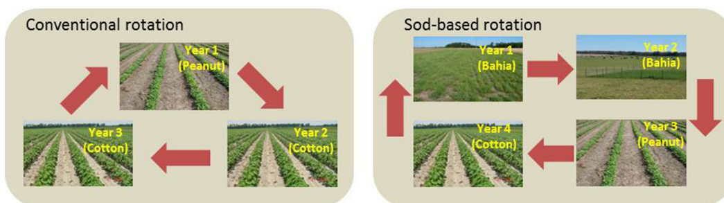
Figure 1. Illustration of conventional and sod-based peanut/cotton rotations. Credits: Figure by Daniel Dourte

A sod-based rotation incorporates two or more consecutive seasons of a perennial grass into a conventional row-crop rotation. One example of a sod-based rotation is an adaptation of the conventional peanut/cotton rotation that farmers follow in North Florida. In a four-year sod-based rotation, bahiagrass is grown for two years, followed by a year of peanuts, and then a year of cotton (Figure 1). In North Florida, bahiagrass is commonly used in the sod-based rotation because it is comparatively easy to establish and it grows well in low fertility soils and under low input