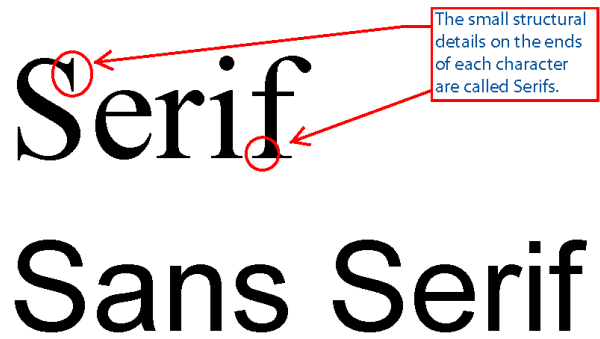
Figure 2. The small structural details on the ends of each character are called Serifs.

When designing any document, the most important aspect to keep in mind about text and typeface is for the lettering to be large enough and legible enough to be read easily. You also should use no more than two typefaces in a document. Use uppercase/lowercase lettering in your document. Only use all uppercase lettering when you want to call attention to