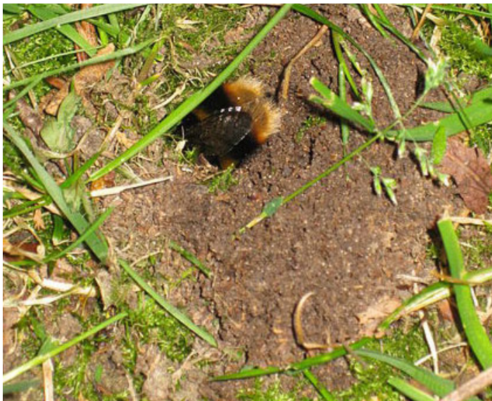
Figure 3. A bumble bee emerging backwards from her nest.

Once a nest site is found, the social bumble bee queen collects pollen and lays her first brood of worker eggs. Workers emerge about 21 days after the eggs are laid and take over the duties of pollen and nectar collection as well as colony defense. The size of the workers increases with each new brood. A third caste of bumble bees, the males, is usually produced in midsummer.