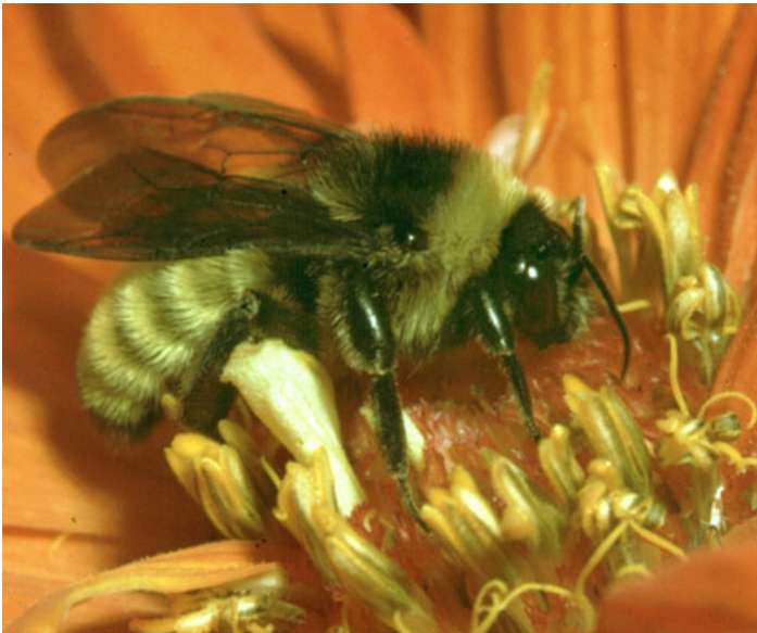
Figure 1. Adult bumble bee, Bombus sp.

Most bumble bees are large, social bees that produce annual colonies. Mated queens overwinter in the soil and emerge from hibernation in early spring when they feed on spring flowers and search for a suitable location, such as a former rodent burrow in the soil, to begin their colonies. These are beneficial insects that pollinate many native and ornamental plants. They can sting severely, so problem nests near human dwellings should be removed by experienced pest control operators.