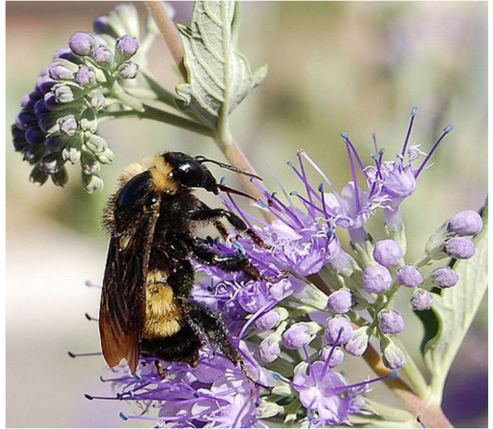
Figure 8. Adult female American bumble bee, Bombus pennsylvanicus (DeGeer).

Bombus pennsylvanicus (DeGeer) 1773, the American bumble bee. Its range extends from Quebec and Ontario, Maryland south to Florida, then west to Minnesota, South Dakota, Nebraska, Colorado, New Mexico, and Mexico (Anonymous 2011). Florida county records include Alachua, Bradford, Collier, Escambia, Flagler, Highlands, Lake, Lee, Levy, Marion, Orange, Putnam, Sarasota, Santa Rosa.