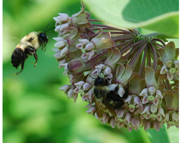
Figure 4. Adult female twospotted bumble bee, Bombus bimaculatus Cresson.

Bombus bimaculatus Cresson 1863, the twospotted bumble bee. Its range extends from Ontario to Maine, south to Florida, and west to Illinois, Kansas, Oklahoma, and Mississippi. Florida county records include Alachua, Clay, Franklin, Highlands, Lake, Levy, Marion, Okaloosa, and Orange.