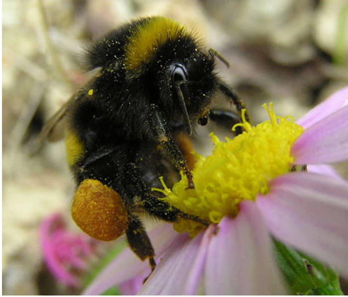
Figure 2. A bumble bee, Bombus sp., with full pollen basket.

sometimes listed as a sub-genus. The parasitic species are easily distinguished by the lack of the corbicula. The most common of this group found in Florida is B. variabilis .