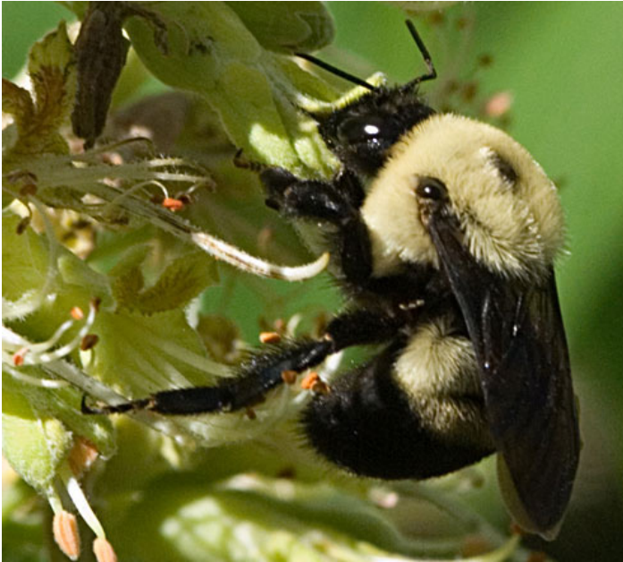
Figure 6. Adult female brownbelted bumble bee, Bombus griseocollis (DeGeer).

Bombus griseocollis (DeGeer) 1773, the brown-belted bumble bee. Its range extends from Quebec and Maine to Florida, and throughout the American West (DL 21011). Florida county records include Alachua, Clay, Collier, Highlands, Marion, Osceola.