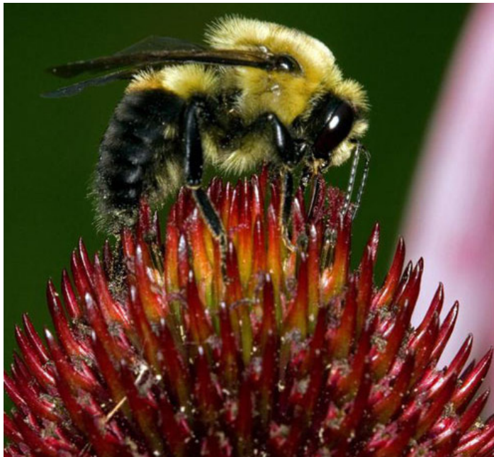
Figure 7. Adult female common eastern bumble bee, Bombus impatiens Cresson.

Bombus impatiens Cresson 1863, the common eastern bumble bee. This species is native from Ontario to Maine and south to Florida and was introduced in California and in British Columbia, Canada (EOL 2011). Florida county