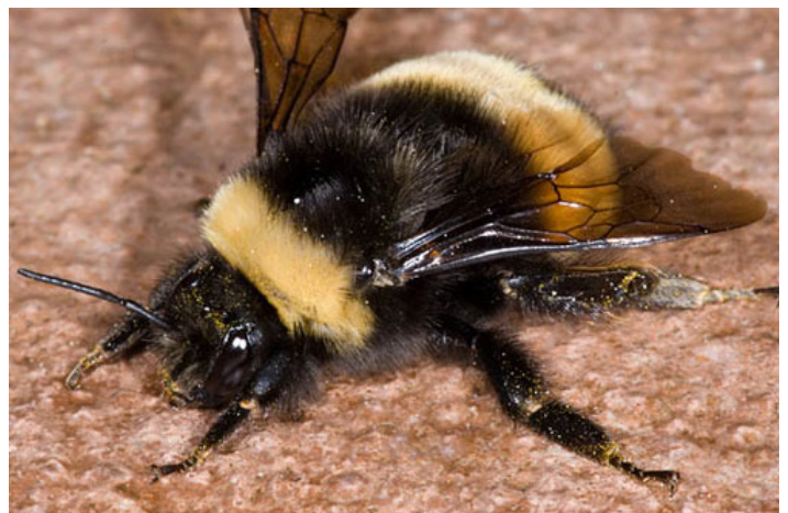
Figure 9. Adult female yellow-banded bumble bee, Bombus terricola Kirby.

Bombus terricola Kirby 1837, the yellow-banded bumble bee. Originally, this species extended from Nova Scotia to Florida, west to British Columbia, Montana and South Dakota. While once common, it has declined dramatically