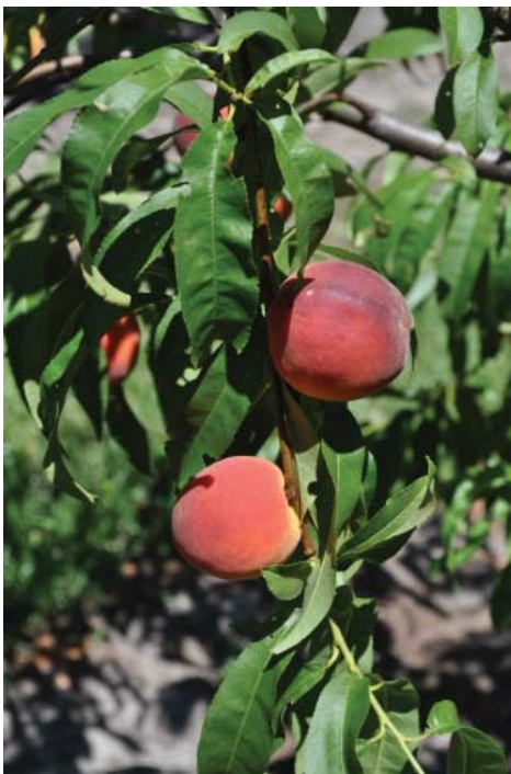
Figure 1. 'TropicBeauty' peach

Florida's mild winter climate and early spring season offer unique opportunities for early season peach and nectarine production. Currently, Florida produces some of the earliest commercial-quality peaches and nectarines in North America. Currently, Florida produces some of the earliest commercial-quality peaches and nectarines in North America (Figure 1). For example, 'UFBest', which is