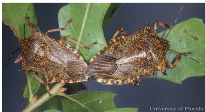
Figure 2. Mating adults of the predatory stink bug, Alcaeorrhynchus grandis (Dallas).

be distinguished by their larger size and double, rather than single, humeral spines.