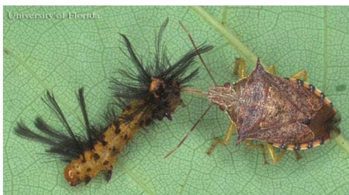
Figure 4. Adult predatory stink bug, Podisus maculiventris (Say). Not only is this predatory stink bug much smaller than Alcaeorrhynchus grandis (Dallas), but notice the single-spined humeral angle.

Eggs: Approximately 1 mm in diameter, with short projections around operculum. They are laid 100 to 200 at a time in multiple row masses. On soybean stems these masses are usually four to five rows wide, but may be as much as 10 rows wide on paper toweling in the laboratory.