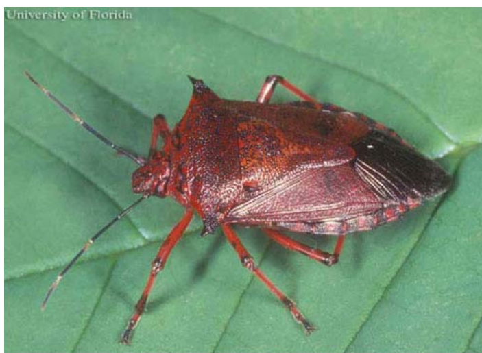
Figure 3. Adult predatory stink bug, Alcaeorrhynchus grandis (Dallas), with an unusual red coloring.