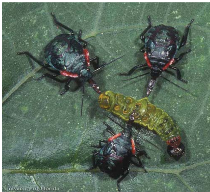
Figure 8. Nymphs of the predatory stink bug Alcaeorrhynchus grandis (Dallas) exhibiting group predatory behavior by jointing attacking a bean leafroller caterpillar.

Although little has been written on this species, it has been reported to be an important predator of soybean pests in Florida (Watson 1916, Whitcomb 1973). It has also been reported to be a pest on eggplant (Watson 1922), but damage to any crops by this species is probably exceptional.