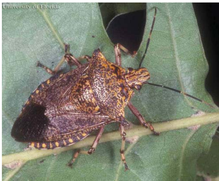
Figure 1. Adult predatory stink bug, Alcaeorrhynchus grandis (Dallas).

Alcaeorrhynchus grandis (Dallas), sometimes called the giant strong-nosed stink bug, is a very large (20 mm) predatory stink bug that occurs in several row crops and preys on other insects, especially lepidopterous larvae. The stages in the life cycle are presented here so that they can be identified in the field.