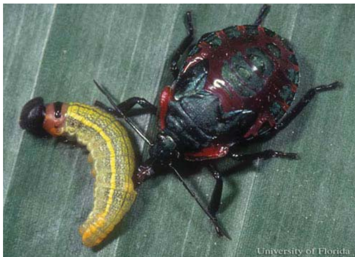
Figure 7. Fifth instar nymph of the predatory stink bug, Alcaeorrhynchus grandis (Dallas), with distinct wing pads.

5th instar. The length is 10–14 mm while the humeral width is 6.5 mm. The 5th instar nymph has distinct wing pads and very large red lateral keels on the pronotum.