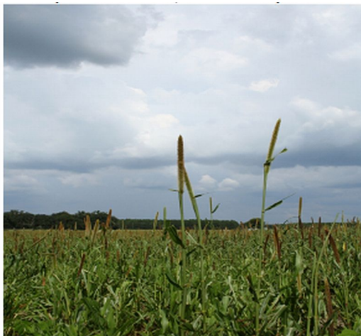
Figure 2. Pearl millet seedhead.

raceme—4 to 20 inches long— that resembles the flower of the aquatic plant known as cattail (see illustration below). The fruit (or caryopsis) is cylindrical, white or pearl in color, or sometimes yellow or brown, and occasionally purple.