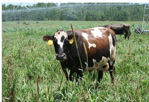
Figure 3. Pearl millet used by grazing dairy cows.

Fall army worms can be a problem in pearl millet. Rust ( Puccinia substriata ) and leaf spot ( Pyricularia grisea ) are some of the plant diseases that will affect dry matter yield. Good management