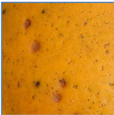
Early Virulent Spot (freckle spot)