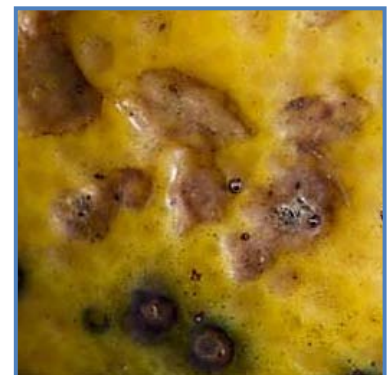
Early Virulent Spot (freckle spot)