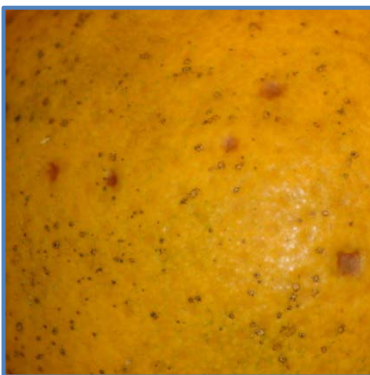
Early Virulent Spot (freckle spot)