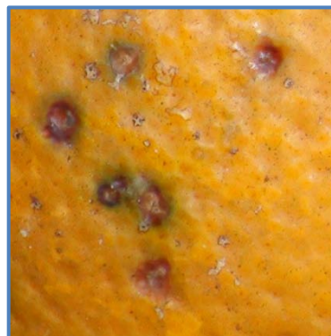
Early Virulent Spot (freckle spot)