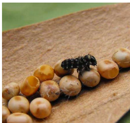
Figure 3. First instar larva of the cecropia moth, Hyalophora cecropia Linnaeus, emerging from egg.

Third, fourth, and fifth instar larvae are similar in their exuberant appearance. The body is very large,