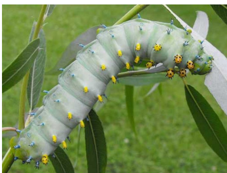
Figure 8. Fifth instar larva of the cecropia moth, Hyalophora cecropia Linnaeus. Although green in color, the top appears to have an iridescent pale-bluish sheen when viewed in direct light.