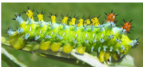
Figure 7. Fourth instar larva of the cecropia moth, Hyalophora cecropia Linnaeus. Photograph by: David Britton. Used with permission.