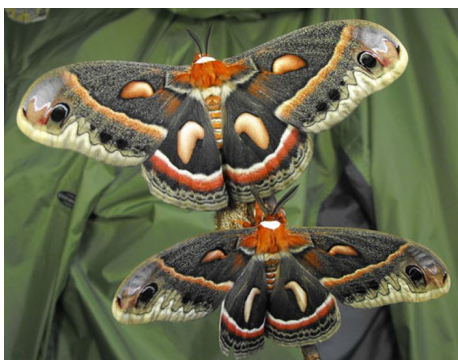
Figure 12. Adult cecropia moths, Hyalophora cecropia Linnaeus. Photograph by: David Britton. Used with permission.