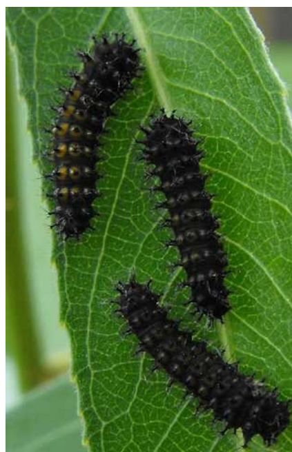
Figure 4. First instar larvae of the cecropia moth, Hyalophora cecropia Linnaeus.