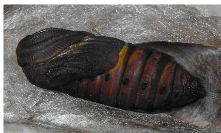
Figure 10. Pupa of the cecropia moth, Hyalophora cecropia Linnaeus, removed from cocoon.

brownish with red near the base of the forewing. Crescent-shaped spots of red with whitish center are obvious on all wings, but are larger on the hindwings. All wings have whitish coloration followed by reddish bands of shading beyond the postmedial line that runs longitudinally down the center of all four wings. The body is hairy, with reddish coloring anteriorly, and fading to reddish/whitish. The abdomen has alternating bands of red and white.