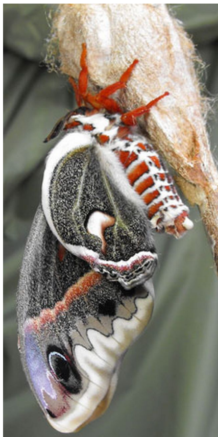
Figure 11. Newly emerged adult cecropia moth, Hyalophora cecropia Linnaeus. Photograph by: David Britton. Used with permission.