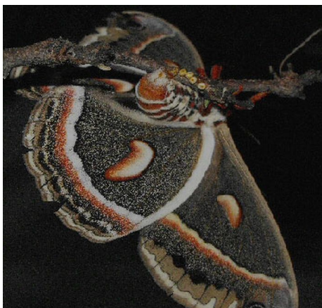
Figure 1. Adult female cecropia moth, Hyalophora cecropia Linnaeus, laying eggs on host plant. Photograph by: David Britton. Used with permission.

The large and mottled reddish/brown eggs are laid by the female on both sides of the host leaf in small groups.