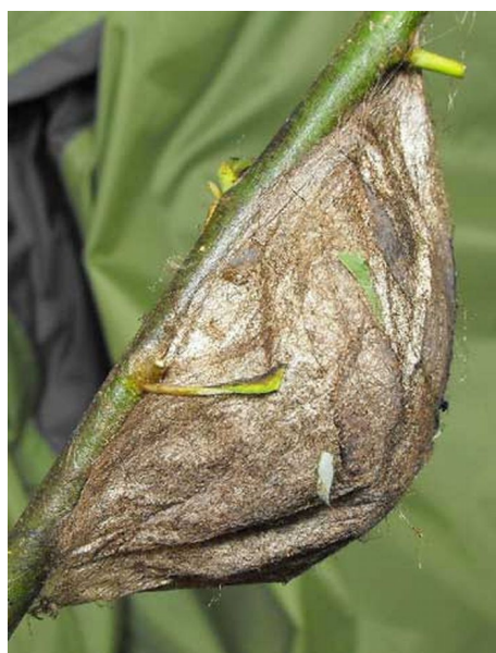
Figure 9. Cocoon of the cecropia moth, Hyalophora cecropia Linnaeus, on host plant.

Size is variable but usually quite large, with a wingspan approaching up to 6 inches. Wings are