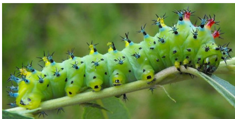
Figure 6. Third instar larva of the cecropia moth, Hyalophora cecropia Linnaeus.

protuberances are pale blue. The larvae of the Columbia Silkmoth ( H. columbia ) are very similar, but have red thoracic protuberances, yellow-pink abdominal protuberances, and side protuberances which are more white than blue with black bases.