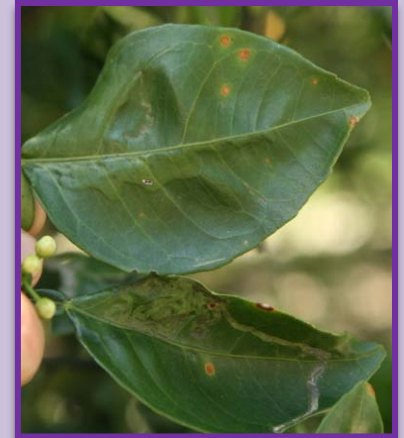
Young lesions on 'Valencia' leaves