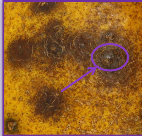
Close view of cracked spot with hard spots forming