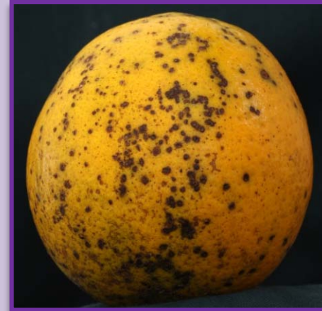
Small lesions that will likely develop into hard spot