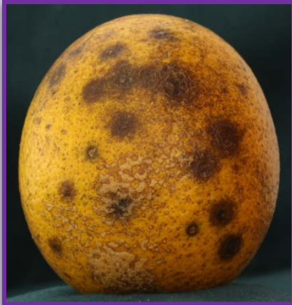
Cracked spot symptoms on 'Valencia'