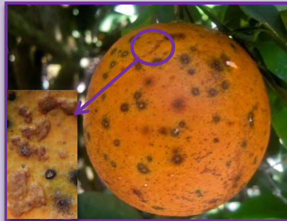
Early virulent (circled) and hard spot lesions with a close-up of virulent spots