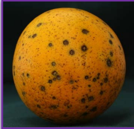
Hard spot symptoms on 'Valencia'