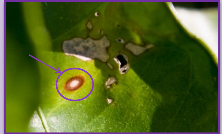
Leaf symptoms on 'Valencia'

4) Early virulent spot (freckle spot) – Small, reddish, irregularly shaped lesions. Occurs on mature fruit as well as postharvest in storage. Can develop into either virulent spot or hard spot. Virulent spot is caused by the expansion and/or fusion of other lesions covering most of the fruit surface toward the end of the season.