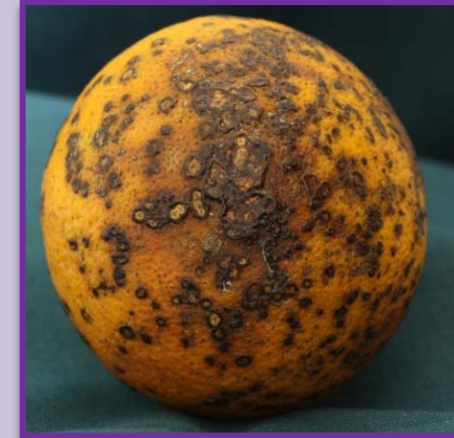
Severe hard spot symptoms on 'Valencia'

Fungal disease: Caused by Guignardia citricarpa (sexual stage) / Phyllosticta citricarpa (asexual stage)