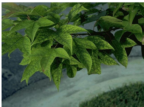
Figure 2. Nutrient deficiency symptoms appearing on new plant growth.

The next step to visual identification of a nutrient deficiency is to determine the characteristics of the symptoms. For example, leaves may appear chlorotic