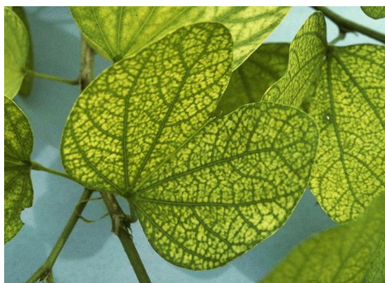
Figure 4. A leaf exhibiting interveinal chlorosis.

exist in forms that are unavailable to plants at alkaline pH. For more information on soil pH and nutrient availability see EDIS publication SL 256 Soil pH and the Home Landscape or Garden : http://edis.ifas.ufl.edu/ss480 . Under these circumstances, a simple soil test can prevent the application of excess fertilizers and thereby reduce the risk of plant or environmental degradation. Also, it can identify situations where foliar fertilizer applications may be more effective than soil applications. For more information about soil sampling and testing see EDIS publication SL 281 Soil Sampling and Testing for the Home Landscape or Vegetable Garden : http://edis.ifas.ufl.edu/ss494 .