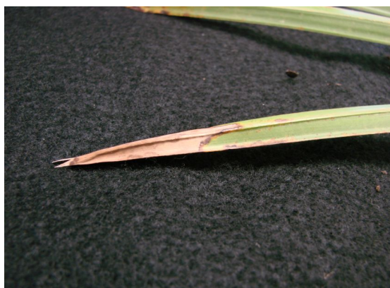
Figure 3. Necrotic (dead) tissue on the leaf tip.

or yellow in color (Figure 1) or there may be necrotic or dead tissue (Figure 3). Symptoms may also present on the leaf tips (Figure 3) or be interveinal (Figure 4). The dichotomous key can be used to aid in the visual diagnosis of common nutrient deficiencies in plants when symptoms present first in old leaves (Figure 5) or new leaves (Figure 6).