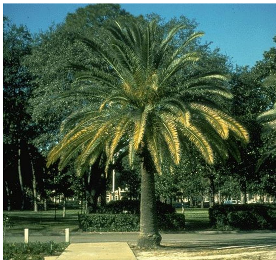
Figure 1. Nutrient deficiency symptoms appearing on old growth. In this case, old leaves are exhibiting chlorosis or yellowing.

The first step to visual identification of a nutrient deficiency is to determine where on the plant the symptoms are appearing. This will be dictated by whether the nutrient is mobile or immobile in the plant. A nutrient is considered mobile if the plant is able to move it from one part of the plant to another as it is needed. In contrast, immobile plant nutrients cannot move to different parts of the plant. Therefore, deficiency symptoms of mobile nutrients will appear first in older parts of the plant (Figure 1), while symptoms for immobile nutrients will be seen first in new growth (Figure 2). For example, symptoms of N, P, K and Mg deficiencies will manifest in the old growth because they are mobile, while symptoms of Ca, Cu, B, Fe, Mn and Zn deficiencies will appear in the new growth because they are immobile.