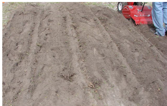
Figure 3. Shallow tillage using a roto-tiller can break up compaction that exists approximately 6 inches below the soil surface.

2. Shallow tillage with a rototiller or similar equipment is one of the most effective ways of breaking up surface compaction; however, it can only improve conditions in the top 6 inches of soil. Shallow tillage is usually done at a depth that will not damage buried utilities, but it should never be done around existing trees because of roots and cannot be used in existing turf (Figure 3).