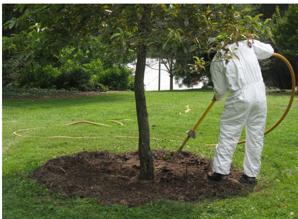
Figure 5. An air tilling tool can be used to loosen the soil around existing tree or shrub roots.

4. Air tilling is as effective as shallow tillage and is safe around trees because it will not damage the root system. It uses compressed air from a special high pressure gun to loosen the soil (Figure 5). This technology was developed by the gas industry to safely excavate around buried gas lines and is gaining popularity among arborists worldwide. This method cannot be used in existing turf.