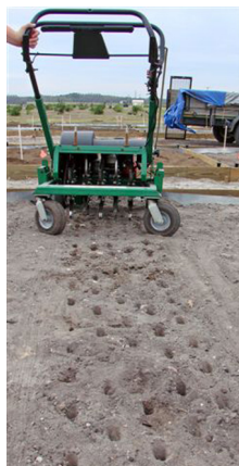
Figure 4. Plug aeration can be used to improve drainage in compacted soils with minimal effect on established plant roots or turfgrass.

3. Plug aeration is frequently used to reduce compaction and improve drainage and aeration in large turf areas, like golf courses and athletic fields. It is not as effective as shallow tillage, but offers a safe alternative in existing landscapes (Figure 4).