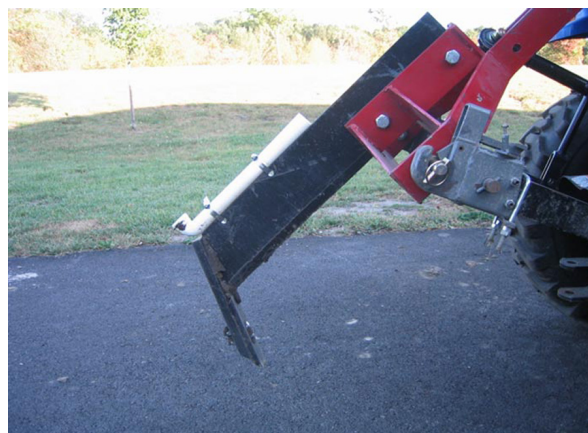
Figure 2. Deep tillage, or subsoiling, requires heavy equipment that can rip soils at depths of 24 inches or more below the soil surface.

1. Deep tillage or subsoiling can be used to break up compaction (up to 24”–36” deep) in the subsoil. While subsoiling is considered the most effective means of breaking hardpans and loosening compacted soils, it requires large machinery (Figure 2) and is often impractical in urban areas because of buried utilities and the cost associated with it. While subsoiling cannot be used to improve existing landscapes, it may be an option at construction sites if implemented before installation of utility lines and landscape plant materials.