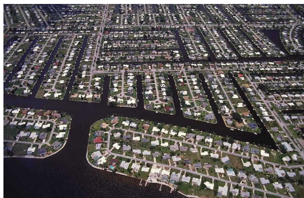
Figure 2. Unplanned growth can contribute to a number of natural resource challenges.

the founder, an officer of the local Audubon Society Chapter, a hospital executive, and a developer. After struggling with conflicting perspectives, the group asked a professional mediator from the University of Florida to facilitate its meetings. During the first facilitated meeting between the steering committee and local stakeholders, the group discussed each participant's interests and concerns related to land use in the county; defined and discussed the ground rules and characteristics of the group; and decided to include expert presentations by the county planner, tax assessor, and water manager in future meetings. Once the ground rules became habit, everyone was able to listen and work together. Each stakeholder was given a chance to speak and all participants vowed to listen.