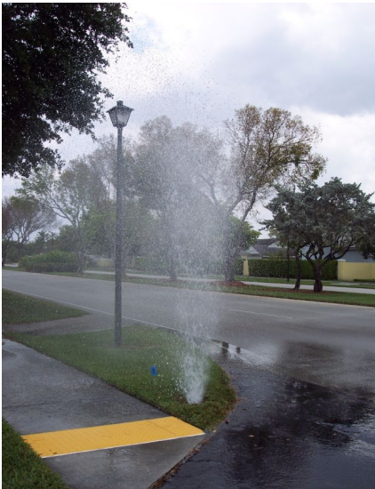
Figure 14. Large dramatic pipe leak.