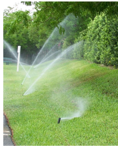
Figure 9. Tilted rotor spraying directly into turfgrass.