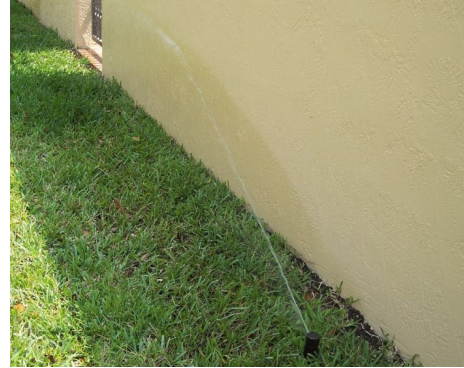
Figure 8. Rotor spraying water on the side of a house instead of the landscape.

The spray direction may be twisted out of alignment with the landscaping over time and need to be repositioned. Note: Twist the pop-up portion of the spray head, while the irrigation is turned on, until the spray is directed toward the landscape.