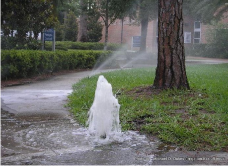
Figure 11. Nozzle on the sprinkler has been knocked off or broken.

usual, possibly leading to weed growth and or fungus (Figure 11). Replacement nozzles for many types of spray heads are available at local hardware stores or can be ordered through a local irrigation supply company.