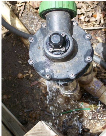
Figure 6. Leak in an indexing valve during irrigation due to high pressure in the system.

It is also important to maintain the area surrounding a sprinkler to prevent obstruction of the spray. Turfgrass can grow over pop-up sprinklers making it impossible for the sprinklers to pop-up. Shrubs and overhanging tree branches may also need to be pruned back far enough to keep the sprinkler from being obstructed. Over time, sprinklers can be pushed further into the ground causing the spray of the sprinkler to not reach surrounding areas. This can happen from vehicles, including lawn mowers, being driven over the sprinkler (Figure 7).