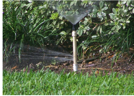
Figure 15. Pipe leak located below a spray head.