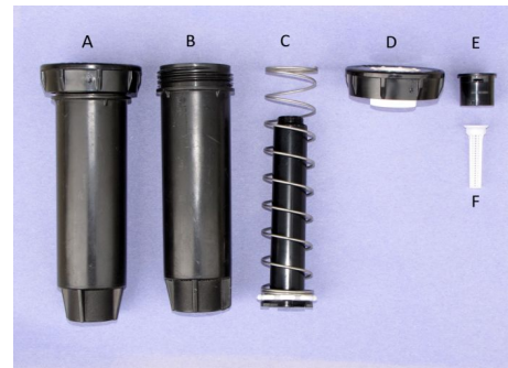
Figure 2. The components in a spray type sprinkler. The assembled spray is shown (A) along with the unassembled spray (B through F). The unassembled parts include the body (B), the spring and pop-up portion (C), the nozzle (E) and the filter (F).