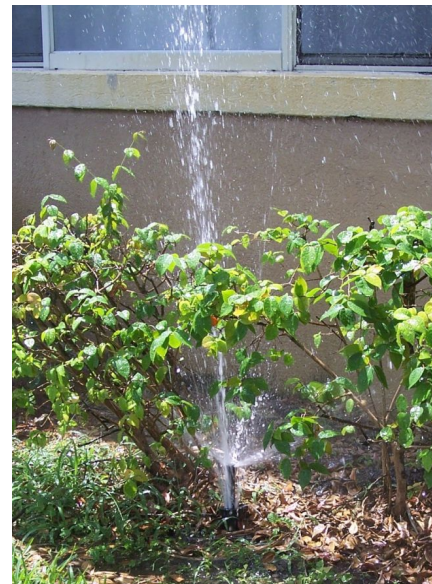
Figure 4. Leak in a spray due to a worn seal.