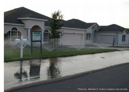
Figure 10. Wet area on pavement around landscaping due to poorly designed irrigation.