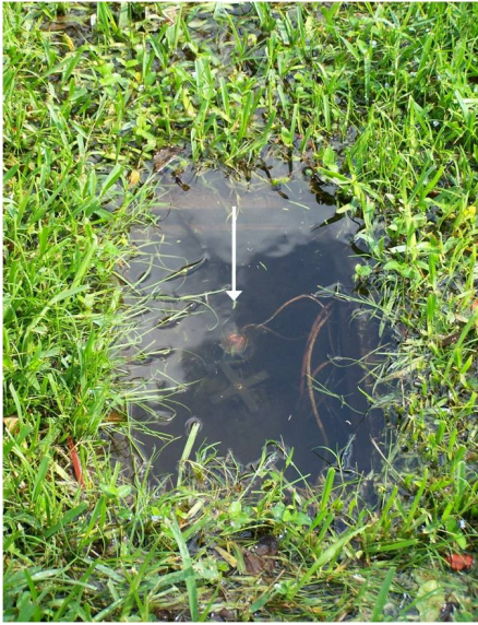
Figure 5. Leaking solenoid valve (indicated by arrow) covered in water after irrigation.