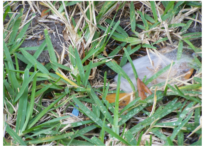
Figure 7. Spray head that no longer pops-up causing irrigation to only reach turfgrass within a couple of inches of the spray.

It is also important to maintain the area surrounding a sprinkler to prevent obstruction of the spray. Turfgrass can grow over pop-up sprinklers making it impossible for the sprinklers to pop-up. Shrubs and overhanging tree branches may also need to be pruned back far enough to keep the sprinkler from being obstructed. Over time, sprinklers can be pushed further into the ground causing the spray of the sprinkler to not reach surrounding areas. This can happen from vehicles, including lawn mowers, being driven over the sprinkler (Figure 7).