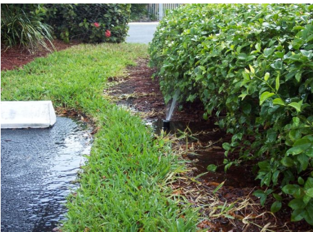
Figure 12. Irrigation system was designed before plants were installed. Modify system to meet plant needs. For established shrubs this sprinkler may not even be necessary.

Landscaped areas can change over time and it is important to take into account the irrigation system design when modifying the landscape. For example, in Figure 12 the rotor is located behind a large shrub causing water to pool right next to the sprinkler. This system could be modified to have a spray type sprinkler on a riser in order to irrigate the entire area or more preferably microirrigation could be used to irrigate the shrub areas (Figure 13). For major design changes to your sprinkler system, contact an irrigation contractor.