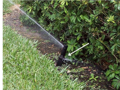
Figure 3. Leak in a rotor due to a worn seal indicated by the arrow. Note that the rotor body is crooked and should be buried to maintain vertical alignment and prevent damage from mowing.

solenoids, gaskets and o-rings to repair valves. For leaking valves, a local irrigation contractor can assist with the repair. More information on irrigation valves is provided in CIR825: Irrigation of Lawns and Gardens http://edis.ifas.ufl.edu/WI003 .