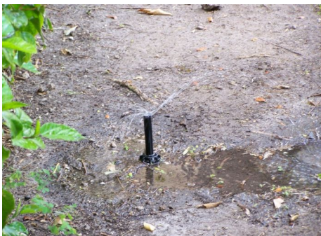
Figure 1. Picture of a clogged spray type sprinkler.