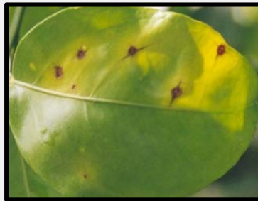
Young Alternaria lesions on leaf; Note necrosis following the vein