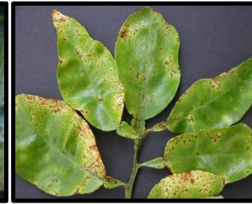
Early season Melanose