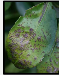
Late season Melanose