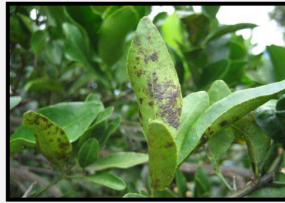
Older greasy spot lesions