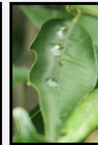
Late season scab lesion