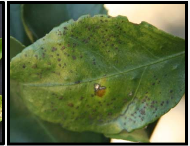
Late season Melanose