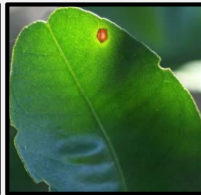
Late season Alternaria lesion on leaf