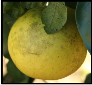
Early greasy spot rind blotch on grapefruit