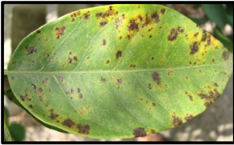
Young greasy spot lesions