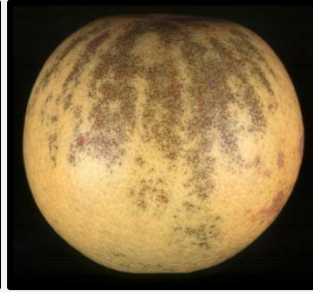
Greasy spot rind blotch on mature grapefruit