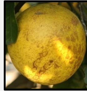
Tear stain Melanose