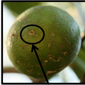
Alternaria lesions on immature fruit