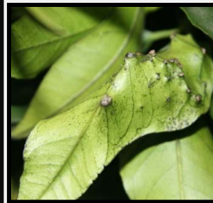
Late season scab lesions on leaves