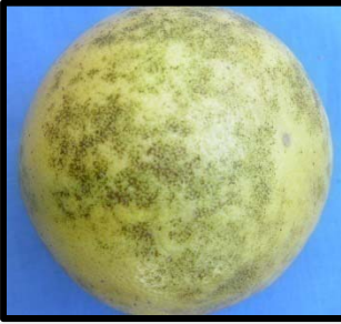
Greasy spot rind blotch on mature grapefruit