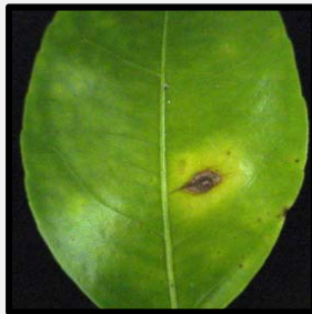
Young Alternaria lesion on leaf