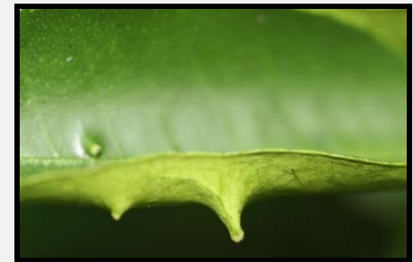
Young scab lesions forming finger-like structures on leaf