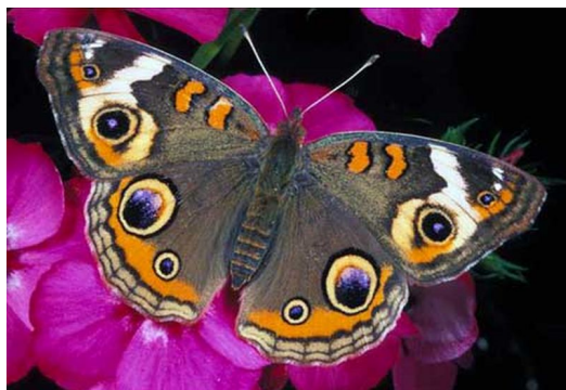
Figure 1. Adult common buckeye butterfly, Junonia coenia Hübner