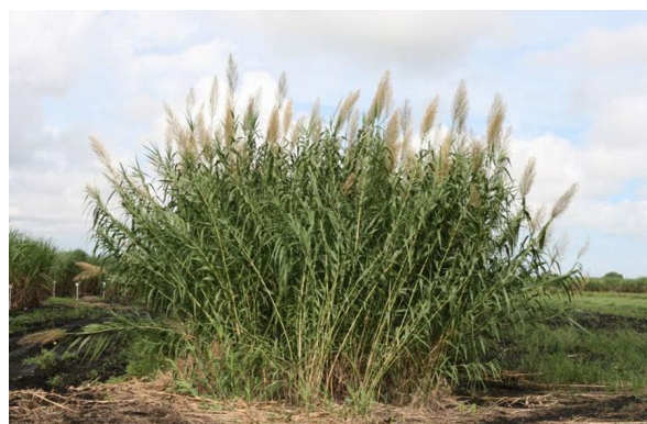
Figure 2. Arundo donax

Although Arundo grows widely throughout the southern states and subtropics, little is known about its biology and cultural practices for commercial cultivation. If Arundo is to be grown for biomass energy, soil stabilization, or pasture, the following establishment and management practices may be considered.