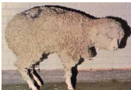
Figure 1. Sheep exhibiting hunched appearance due to pain in inflamed coronary bands.

Bluetongue virus may infect several different domestic and wild ruminant species including cattle, deer, goats, and sheep. However clinical signs are most apparent in sheep where signs include 5-7 days of increasing temperature (up to 107.6°F), excessive salivation, hyperemia and swelling of the nasal and buccal mucosa, hemorrhaging in the mucosal membranes in the mouth, oral erosions, swollen tongue, loss of wool, depression and hemorrhages in the coronary bands of the hoof that often result in lameness, and difficulty standing (Fig. 1)