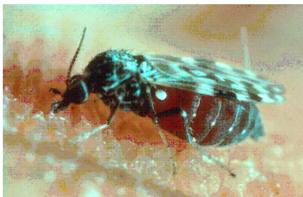
Figure 2. A Culicoides sonorensis female after blood feeding

The cycle of transmission is from a competent Culicoides to a ruminant animal, back to a susceptible Culicoides , to a ruminant and back to a Culicoides , etc. The female Culicoides requires a blood meal in order to lay eggs. Different Culicoides species prefer different types of habitats to lay eggs. Culicoides sonorensis prefers heavily organic rich water, with high manure content for egg laying and subsequent larval development. Some African Culicoides vectors lay eggs directly in the deposited dung of ruminants. Both types of insects, therefore, lay their eggs and complete larval development near ruminant livestock habitat.