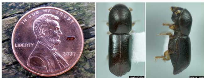
Figure 1. Redbay ambrosia beetles ( Xyleborus glabratus ): a) comparison of beetle to a penny; b) top view and c) side view of a single adult.

The redbay ambrosia beetle is very small (about 2 mm long), dark brown to black, and cylinder-shaped. To the unaided eye it is similar in appearance to other ambrosia beetles found in Florida (Fig. 1). Female beetles fly and are much more numerous than the smaller, flightless males. It is important to note that the redbay ambrosia beetle would not likely kill trees nor be a pest without the disease-causing fungus it carries.