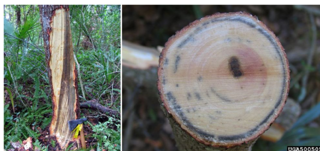
Figure 5. Symptoms of laurel wilt in redbay trees: a) removing the bark reveals dark staining of the sapwood and b) the dark color of the outer ring of sapwood below the bark indicates the tree has been infested by the redbay ambrosia beetle and the wood colonized by the laurel wilt fungus. The fungus that has colonized the sapwood blocks water and nutrient movement in the tree.