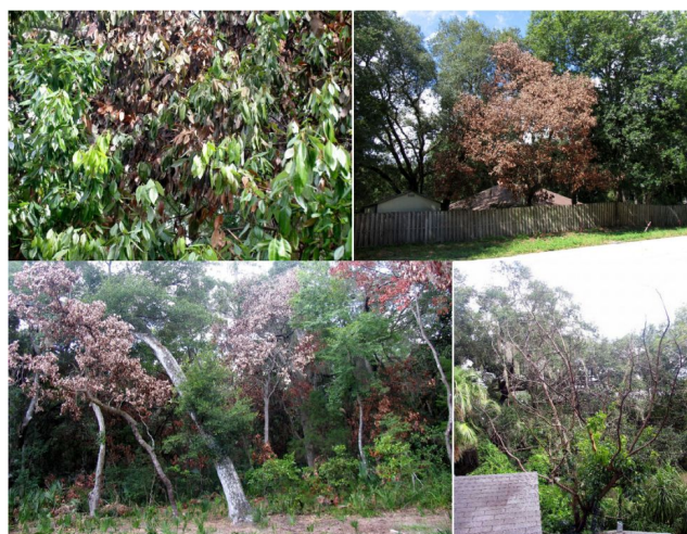
Figure 3. Whole redbay trees killed by laurel wilt.