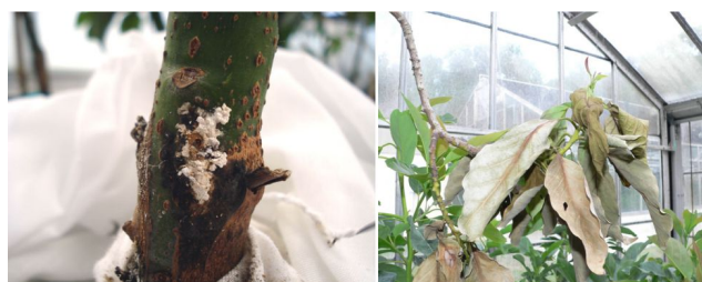
Figure 4. a) A bore-hole from a redbay ambrosia beetle surrounded by dried sap (white-crystal-like) from an avocado stem and b) wilted leaves of laurel-wilt-infected avocado tree.