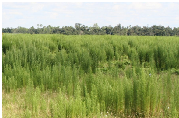
Figure 1. A bahiagrass pasture infested with dogfennel and TSA.

Tropical soda apple (TSA) continues to be a problem in Florida pastures, but other weeds are often present in significant numbers. Dogfennel is the most widely encountered weed in Florida pastures and it is commonly found growing along with TSA (Figure 1). Although Milestone is highly effective on TSA, it provides little or no dogfennel control. Likewise, Forefront (a mixture of 2,4-D and Milestone) is more effective than Milestone, but still fails to control large dogfennel plants. To illustrate, UF-IFAS research has shown that Forefront applied at 2 pints/acre was excellent on TSA, but highly inconsistent (30 to 95% control) when dogfennel was 30 inches or greater in height. Increasing the rate to 2.6 pints/acre improved the consistency of control for 30 inch-tall dogfennel, but failed to control plants that were 40 inches tall or greater. Since TSA and dogfennel of all sizes are common throughout Florida, Forefront + another herbicide will be required to effectively control both species.