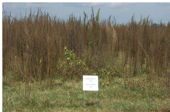
Figure 3. Dogfennel control with 2.0 pints/acre Forefront plus 3 pints/acre 2,4-D amine 60 days after a large scale pasture application.

The tank-mix treatments in Figure 2 were applied on a large scale to demonstrate the success of these tank-mix treatments. All treatments performed similarly (Figure 3), but dogfennel at the time of application was at least 6 feet tall. Therefore, these tank-mix combinations can be utilized for both dogfennel and TSA control at any growth stage.