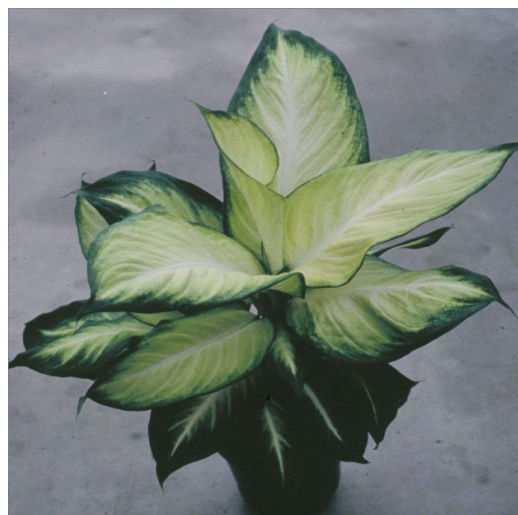
Figure 3. Dieffenbachia 'Triumph', the first hybrid Dieffenbachia released by the University of Florida, was the result of interspecific cross breeding. (Henny et al. 1987)

Foliage plants will generally flower and can be cross-pollinated. Techniques to produce flowering on demand (Henny, 1988; 1995) and induce hybrid seed production (Henny, 1980) were developed at the University of Florida in the early 1980s. Traditional breeding through hybridization has focused on maximizing heterozygosity. Therefore, interspecific hybridization has become the most common practice in breeding hybrid foliage cultivars (Figure #3). Interspecific hybridization offers opportunities for obtaining gene recombinations and expands the range of genetic variability beyond that of a single species. Additionally, interspecific hybridization creates unique ornamental characteristics that could not be achieved through intraspecific crosses. Parents used in foliage plant hybridization are not usually derived from inbred, single-seed descent, or pedigree selection because inbreeding depression limits development of inbred lines in most foliage plant genera. By intercrossing distinct clones, both of which have desirable characters, populations are created that may be utilized directly for selection of new clones. If the parent clones are heterozygous, each seedling is a potential new cultivar that can be fixed by vegetative propagation.