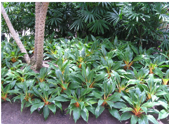
Figure 1. Chlorophytum orchidantherioides 'Fire Flash' came into the foliage industry through collection from the wild.

Florida from a plant collected during a visit to Holland in 1954, where it was discovered growing in a container in a hotel lobby.