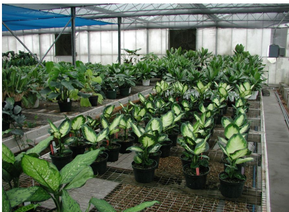
Figure 4. Growth studies, conducted at the Mid-Florida Research and Education Center in Apopka, FL, are a key component in the evaluation process for the new Dieffenbachia cultivar above.

68:565–651. Missouri Botanical Garden Press, St. Louis, MO.