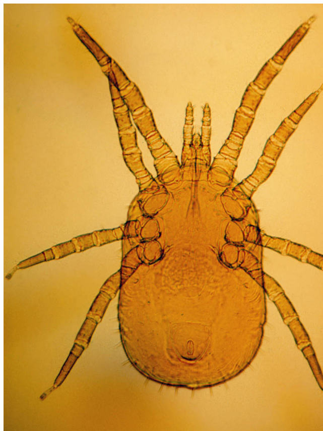
Figure 5. Red chicken mite.

The common red mite (Figure 5) is found on domestic fowl throughout the world, parasitizing chickens, turkeys, pigeons, wild birds and occasionally man. Older fowl exhibit similar symptoms of infestation as those parasitized by northern fowl mite. Young chickens will usually die when attacked by this mite. The red mite also serves as the vector for avian spirochetes.