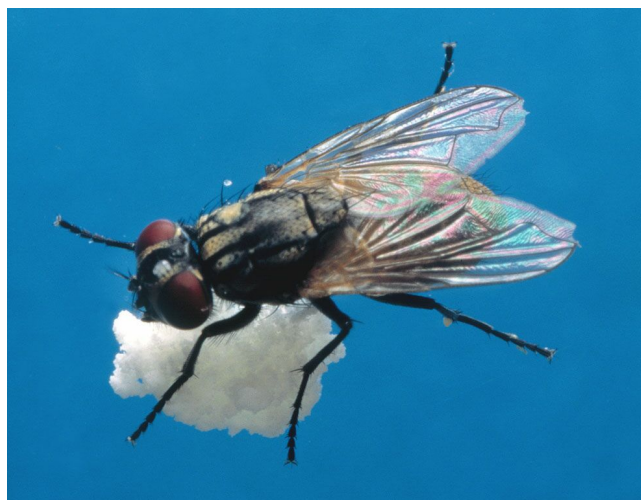
Figure 9. House fly.

House fly eggs are laid in almost any type of warm organic material; however, poultry manure is an excellent breeding medium. Fermenting vegetation such as grass clippings and garbage also provide a medium for fly breeding. The white eggs, which are laid in clusters of 75 to 100, hatch within 24 hours into minute larvae or maggots. In 4 to 6 days the larvae migrate to drier portions of the breeding medium and pupate. The pupal stage may vary in duration considerably, but in warm weather can be about three days.