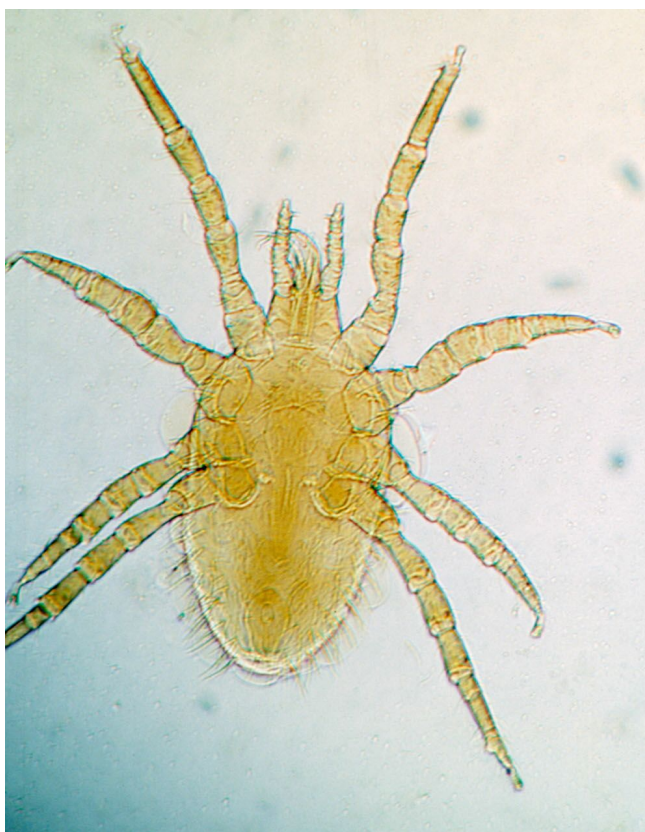
Figure 6. Tropical fowl mite.

The tropical fowl mite (Figure 6) is widely distributed in South America, the Caribbean and southern United States. It is a mobile species and will feed during the day or night. Besides domestic fowl, the tropical fowl mite prefers English sparrows and transmission from wild birds to domestic fowl are quite common.