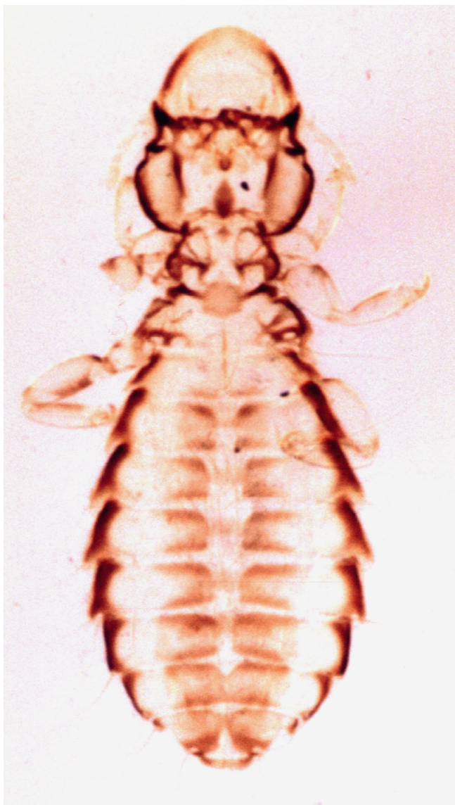
Figure 3. Chicken head louse.