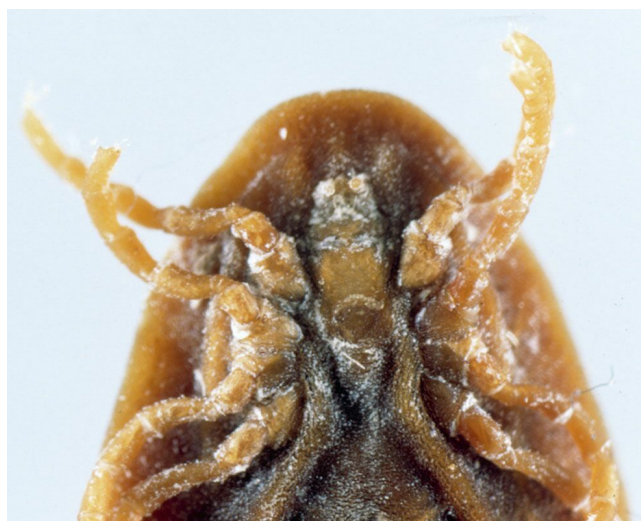
Figure 7. Fowl tick.

The fowl tick (Figure 7), also called the blue bug, injures poultry by blood feeding, causing weight loss, blemishes, and lower egg production. The tick is especially difficult to control since it hides near the roosts of birds during the day. At night, however, the nymphs and adults climb onto the birds and engorge themselves with blood.