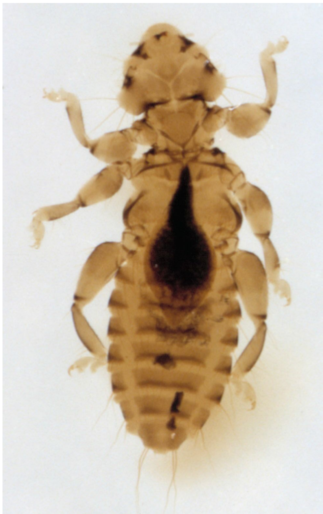
Figure 1. Shaft louse.

The shaft louse (Figure 1) is the most serious louse pest of chickens. It feeds on the barbs and scales of the feathers, causing little host irritation. It is usually not found on young chickens because of their lack of well-developed wings. The adults, nymphs and eggs are found on the feathers and generally damage the plumage. The shaft louse also will infest ducks, turkeys and guinea hens if they are housed close to infested poultry.