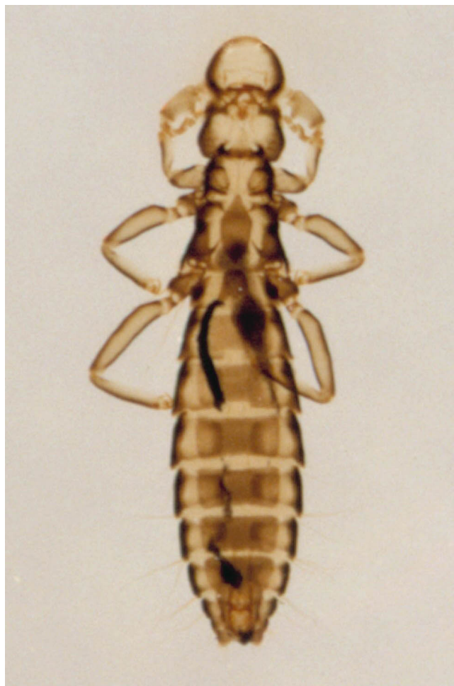
Figure 2. Wing louse.

skin are made bare. Infested birds commonly scratch themselves with their claws, causing intense irritation.