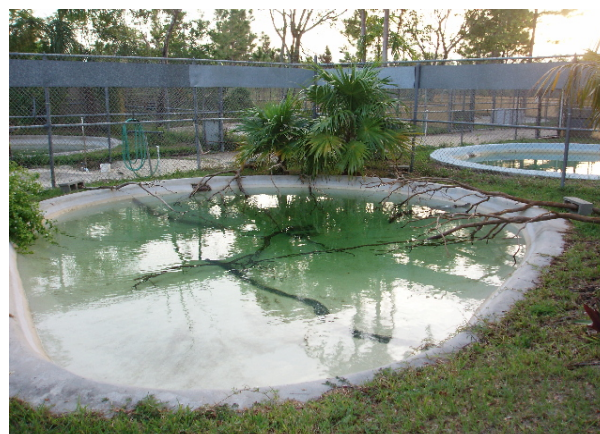
Figure 11. Enclosure with a regular shaped pond with logs and branches to create barriers.

uses hoses to pump the water from the pond to a treatment site (Ziegler 2001). Pool shape greatly influences the number and size of animals that can be housed together, the safety of keepers, and the aesthetics of the enclosure. Creating breaks in the line of sight between areas of the pool creates visual isolation between animals and helps to reduce stress and aggression (Lang 1987a; Morpurgo 1992). Irregular pool shapes can best create these 'visual barriers' combined with physical barriers (land and vegetation) (Lang 1987a; Morpurgo 1992) (Figure 9 and Figure 11). Although 'U' or 'V' shaped pools are recommended over circular or rectangular pools, 'S' or 'Z' shaped pools can usually accommodate more animals with less conflict (and often less total area per animal) (Ziegler 2001). If circular or rectangular pools must be used, barriers should be incorporated in the form of partially submerged logs, boulders, or islands, which will create some degree of separation between animals (Vernon 1994; Ziegler 2001) (Figure 11). More complicated shapes usually increase construction costs.