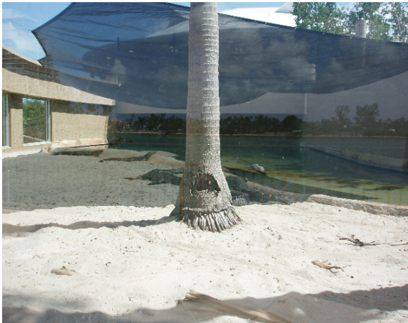
Figure 12. Simple enclosure with sand substrate, shade cloth, and all areas visible.

(Ziegler 2001). Substrates such as rock and woodchips can cause intestinal blockage if ingested and provide a breeding ground for bacteria (Ziegler 2001). Enclosures can be sparsely or densely planted so long as adequate shade is provided for all animals (Britton 2001) (Figure 7 and Figure 12).