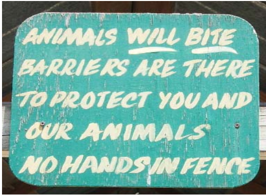
Figure 13. Signs reinforcing safety should be placed throughout any facility open to the public. Photo credits: Matthew Brien, 2006.