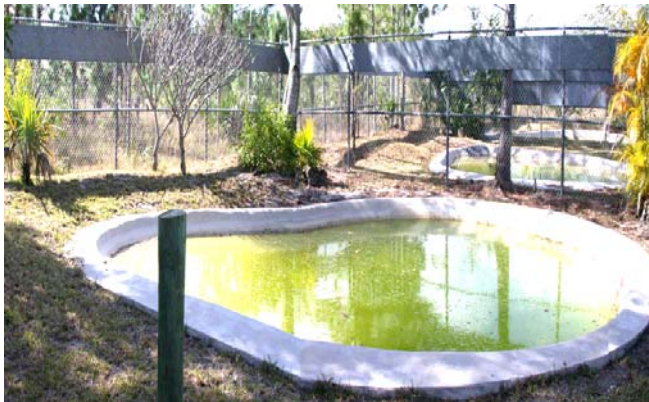
Figure 1. Shallow concrete pond, recommended for one or two adults or several juveniles.

Enclosures can be designed for exhibit or not. Exhibit enclosures are those intended to provide ample viewing opportunities for public observation of the animals. They require the most careful planning and construction. Enclosures that are used to house animals not intended for public display (e.g., breeding, rearing, and holding) can often be constructed with less financial investment. Both enclosure types share similar minimal requirements of providing safe and secure confinement in a manner that also provides for the health and well being of crocodiles (QLD 1997; Ziegler 2001). Exhibit enclosures must also account for public safety and be aesthetically pleasing (Figure 3). Off exhibit enclosures can often be far more utilitarian in terms of landscape design and orientation (Figure 4). Off exhibit enclosures can generally be designed to accommodate more individuals while requiring lower construction and maintenance costs (Ziegler 2001).