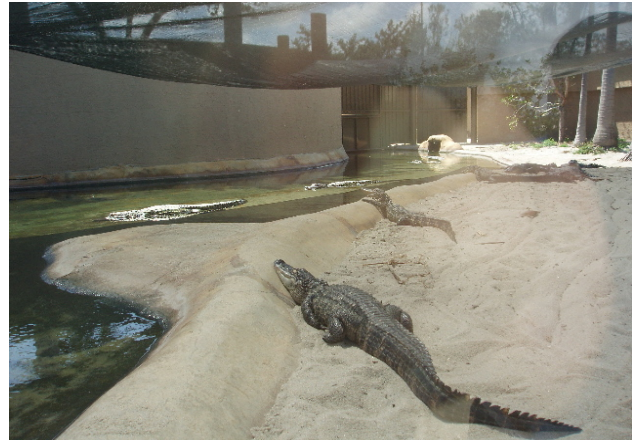
Figure 9. Enclosure including pond with multiple haul out areas, irregular shape and smooth surface.

While natural ponds (or engineered excavations below the water table) are sometimes incorporated into captive enclosures, they present many challenges to the facility. Locating and monitoring the health of individuals kept