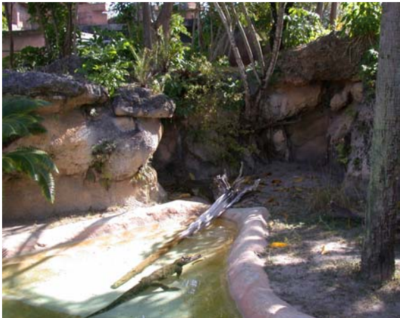
Figure 3. Crocodilian 'exhibit' enclosure. Open to the public.

Many factors influence decisions that facilities make when constructing crocodile enclosures. The two most restrictive are space and budget. Carefully weighing options and having a solid plan for the future of the facility will save a great deal of money and time while accomplishing the minimum goal of safe and humane confinement.