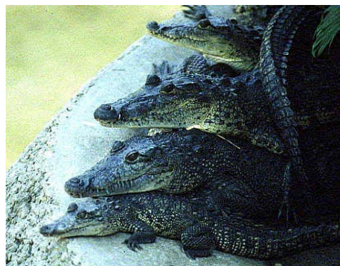
Figure 6. Morelet's crocodiles ( Crocodylus moreletti ), Photo credit: Wayne King.

(Groombridge 1987; Lang 1987a; Ojeda et al. 1998). Both species possess a commercially high quality skin, are relatively non-aggressive, and have been found to demonstrate a high tolerance of conspecifics (Lang 1987a; Thorbjarnarson 1992). Due to the high quality of their skin, both species have been targeted extensively by hunters leading to their classification under Appendix 1 (CITES), and they are considered endangered (Thorbjarnarson 1992).