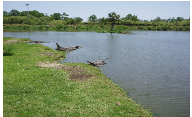
Figure 2. Natural style pond more suited to adults.