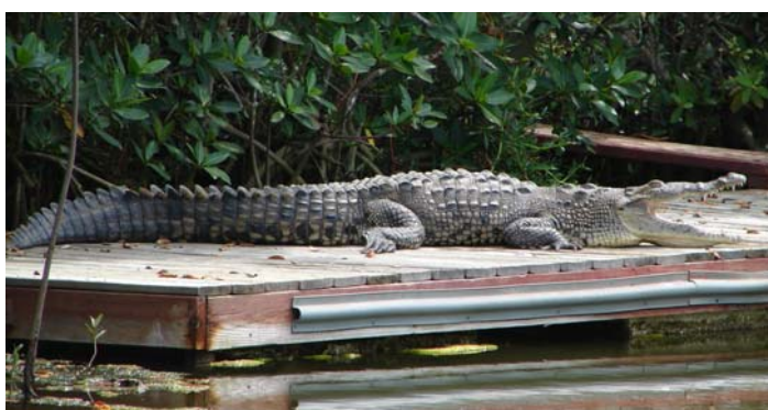
Figure 5. American crocodile ( Crocodylus acutus ), Photo credit: Michael Cherkiss, 2006.

Elevated stress levels in captive crocodilians can lead to poor growth and survivorship, disease, poor skin quality, and reproductive failure (Elsey et al. 1994; Lance 1994; Smith and Marais 1994). The overall success of any facility holding crocodilians relies upon reducing the amount of stress to individuals by providing and maintaining high water