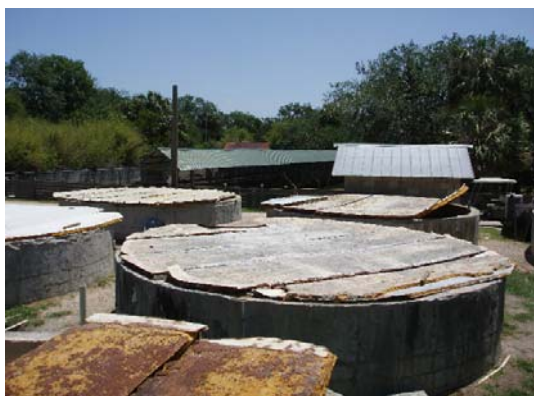
Figure 15. Darkened, climatically controlled, cement ponds provided for hatchlings and grow out animals.

As with all other size classes the temptation to stock hatchlings at high densities should be avoided (Pooley 1990). Optimal stocking rates can be achieved through trial and error. Individuals should also be segregated according to their respective size class (Pooley 1990). It is recommended that temperature fluctuations, loud noise, and changes in diet be avoided (Webb and Manolis 1989; Thuok 1998). They should be strictly fed a fresh, high quality diet (see Feeding and diet). As a general rule, feeding should occur 6-7 days a week, and then reduced to 3-4 days a week after 3-4 months. After one year they should be fed every other day. It is important that the handling of hatchlings be kept to an absolute minimum, and that the design of the tanks enables regular and effective cleaning with minimal disturbance (Huchzermeyer 2002).