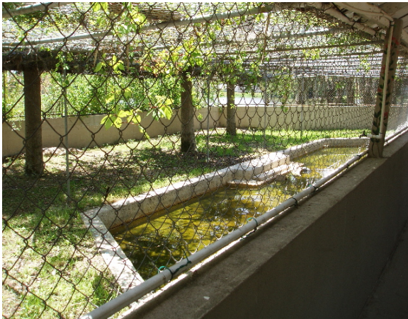
Figure 7. Simple enclosure with grass/soil substrate, sturdy trees, adequate shade from trees, and all areas visible. Photo credit: Matthew Brien, 2006.

Regardless of materials used, the fence of the enclosure must be properly constructed to prevent escape. This requires extension above and below ground, as crocodiles can be excellent diggers and climbers (Pooley 1990). Fence height should be equal to the total length of the largest animal being housed, or have a turn back at the top to force a climbing animal to fall (Ziegler 2001).