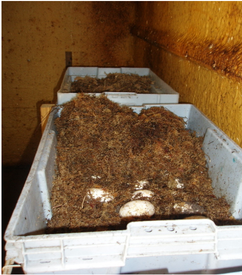
Figure 14. Eggs placed in moist, warm artificially controlled incubation chamber.

For C. acutus , clutch sizes tend to be between 30-60 eggs (Thorbjarnarson 1989) while C. moreletti lay around 20-40 eggs (Thorbjarnarson 1992). Incubation times are generally between 80-90 days for both species, but this is essentially temperature dependent (Britton 2001). Incubation times for C. moreletti have been achieved at around 69 days in captivity at higher temperatures (Ojeda et al. 1998).