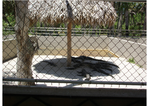
Figure 4. Crocodilian 'off exhibit' enclosure. Not open to the public.