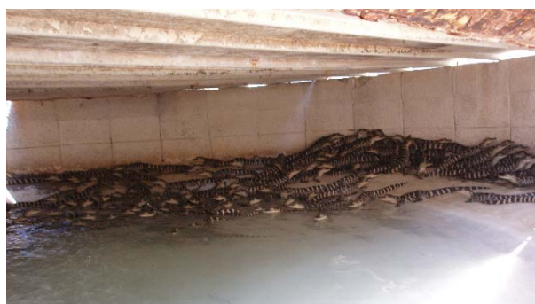
Figure 10. Hatchling alligators housed together in shallow ponds with smooth surface.

enclosure (Hutton and Jaarsveldt 1987; Pooley 1990). This will enable each pond to be cleaned alternately to avoid displacing all crocodiles from the water each time, thus reducing stress (Hutton and Jaarsveldt 1987; Pooley 1990). They can then also be cleaned more thoroughly (Child 1987). The pond(s) should typically be around 10-15m long by 1.5m wide and 60-100cm deep (Ziegler 2001).