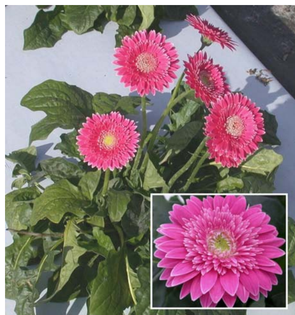
Figure 2. Flowers and plants of 'UF Multi-flora Pink Frost' gerbera grown in a raised bed.

Plant growth and flowering of 'UF Multi-flora Peach' and 'UF Multi-flora Pink Frost' were compared to 'Revolution Formula Mix' and 'Louisville'. 'Revolution Formula Mix' is a popular