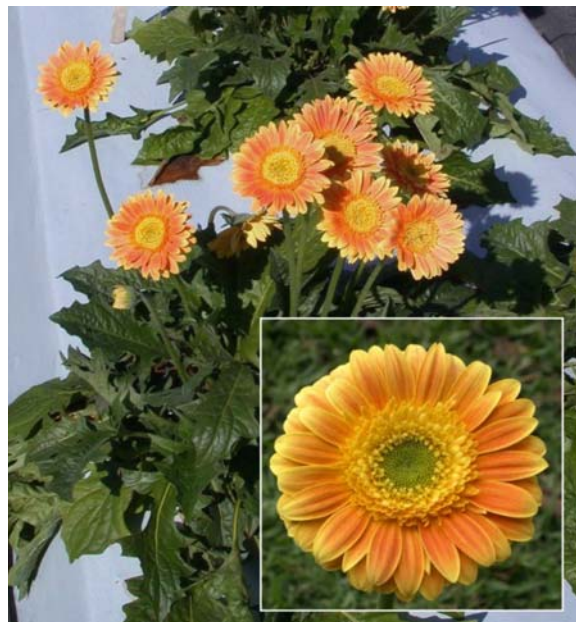
Figure 1. Flowers and plants of 'UF Multi-flora Peach' gerbera grown in a raised bed.

lobed, with deep lobes on the base, medium in the central part and slight at the apice. The flowers were semi-double and 3 1/2 inches in diameter. The average peduncle height of immature and mature flowers is 14 and 18 inches, respectively. The disc florets were a deep bright yellow and the inflorescence center light yellow. The upper surfaces of the outer ray florets were orange-red diffusing into yellow.