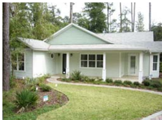
Green building, Gainesville, FL.. Credits: Mark Hostetler, 2006.

Policies of local governments can play a major role in creating opportunities for sustainable practices. In addition, governments can take the lead in sustainable planning and development in designing public facilities or government office buildings according to sustainable design standards. By taking the lead in crafting unique policies and implementing ways for government to reduce energy consumption or negative environmental impacts, a local government can initiate small changes that will lead to a sustainable community.