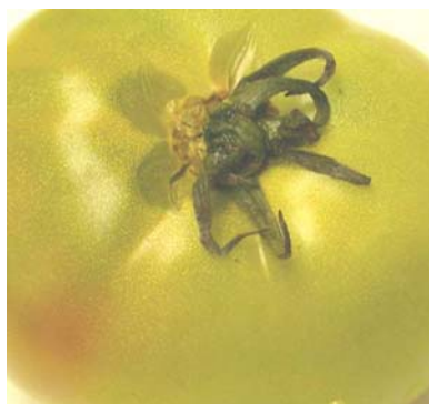
Figure 1. Bacterial soft rot - internal lesion. Bacteria entered into fruit under the stem attachment