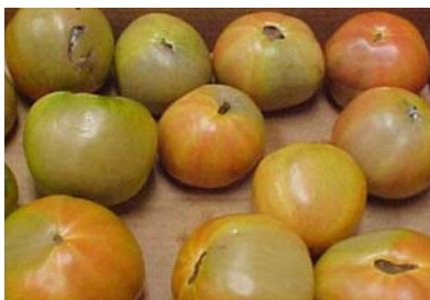
Figure 6. Sour rot - internal lesions from natural outbreak. Rough fruit became infected through blossom-end scars and wounds. Tissues appear to be pickled with only a little evidence of fungal development at the surface.