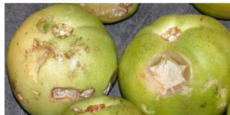
Figure 4. Rain check. Dark checked areas are a severe form of cuticle cracking that develops in wet weather. The cracks enable attack by postharvest pathogens.