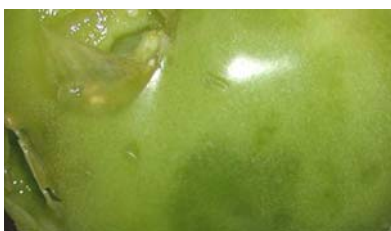
Figure 7. Sour rot infection in green tomato involves high water content. An apparent bruise with infection occurring at tiny cracks in the fruit surface is evidence that this fruit is tender, which likely means high water content.