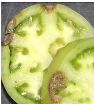
Figure 8. Arrested sour rot lesions. Sour rot lesions in green fruit may become arrested when exposed to air. The decay will resume development as the fruit ripens.