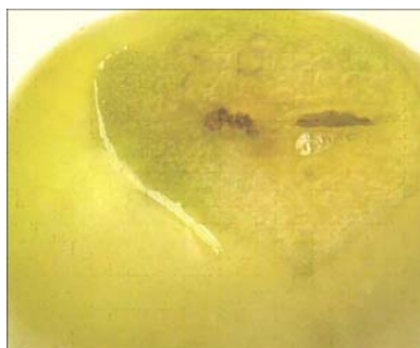
Figure 2. Bacterial soft rot - internal lesion. Bacteria entered through blossom-end scar of fruit.