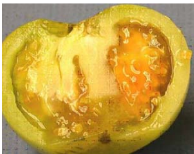
Figure 3. Bacterial soft rot - internal lesions. Internal view of bacterial soft rot that began at blossom and stem ends of fruit