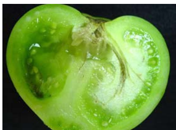
Figure 10. Bacterial soft rot - internal lesion. Water - congested stem scar, such as was present in Figure 9, eliminated protection provided by a dry stem scar and enabled bacteria to enter fruit by capillary forces.