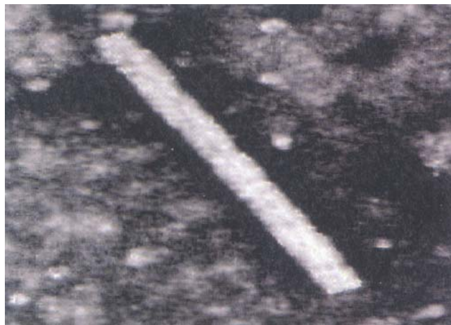
Figure 3. Typical rod shaped virus as seen through a powerful electron microscope.

Viruses are most strange indeed (Fig. 3). They are not "organisms" in the sense of the fungi and bacteria. They are very large molecular structures consisting of a nucleic acid (DNA or RNA) wrapped in a protective coating of protein. Once inside plant cells, they take over the host cellular machinery and use it to produce more viruses. Most of the important viruses are transmitted to garden plants by insects such as aphids, whiteflies, or thrips.