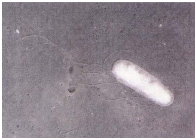
Figure 2. A bacterial cell.

Bacteria are even smaller than fungi (you need a 1000x magnification with a special light microscope to see them) (Fig. 2). They consist of only one cell and do not form the airborne spores that fungi do. Rather than being blown by the wind, bacteria are usually spread by splashing water, as in rainstorms or overhead sprinkler irrigation. They can also be spread by gardeners who touch diseased plants and healthy plants in succession without thoroughly washing their hands in-between.