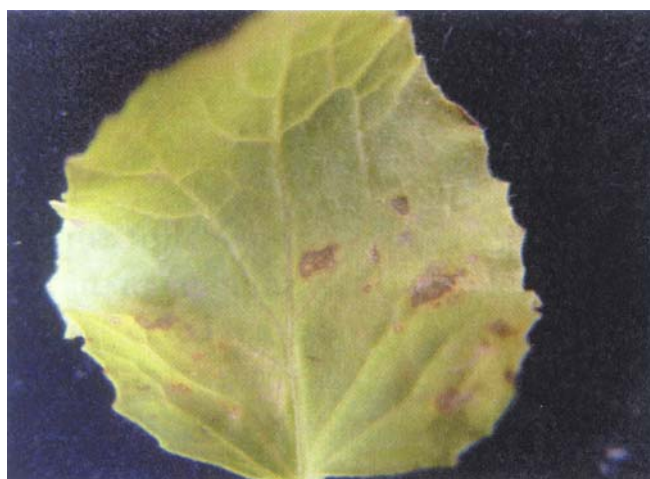
Figure 5. Angular leaf spot on young cantaloupe leaf.

Symptoms of angular leaf spot occur on the leaves, stems, and fruit. Spots on the leaves are irregular in shape, angular, and water-soaked (dark-green along margins of the spot). Free moisture allows the bacteria to ooze from the spots, which, upon drying, leave a white residue. The spots of dead tissue will occasionally drop away from the healthy tissue leaving irregular holes in the leaves. The bacterium is seedborne and rain-splash dispersed. This bacterial disease occurs during cool, damp weather. The best cultural control methods for angular leaf spot are to: a) use pathogen-free seed; b) rotate land and c) avoid handling plants when wet. Consult with the UF IFAS Cooperative Extension Service for recommended copper fungicides.