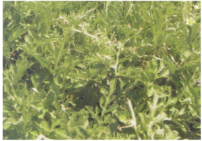
Figure 10. Typical virus symptoms on cucurbit plant.

The viruses listed above are the most common viruses in cantaloupe in Florida. Viruses symptoms typically appear on leaves show varying degrees of mottling, distortion and stunting. Growth habit may be altered as infected vine tips appear more erect. Fruits may occasionally be mottled and deformed. These viruses may also occur naturally on many weed hosts throughout the state and move into cantaloupes by aphid feeding. Try to eliminate weeds in and around plantings. This will aid in virus control. Treating gardens repeatedly with insecticides for aphid control is not recommended because of the short time period needed by aphids to transmit the virus while feeding.