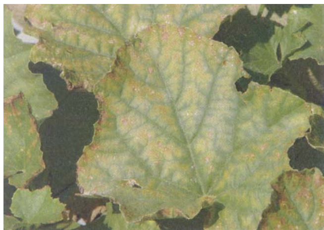
Figure 6. Symptoms of downy mildew.

This disease first appears on the foliage as pale areas separated by islands of darker green tissue. These spots develop into an angular, yellowish lesion. Older lesions become brown and necrotic. Severely affected leaves may become chlorotic, brown and shrivel. During moist periods, a grayish spore mass may be observed on the lower leaf surface under these spots. Spores are dispersed by wind. It is virtually impossible to avoid this disease in south Florida. See Plant Pathology Fact Sheet PP-2. Prior to planting, choose a variety with resistance to this disease. Consult with the UF IFAS Cooperative Extension Service for recommended fungicides.