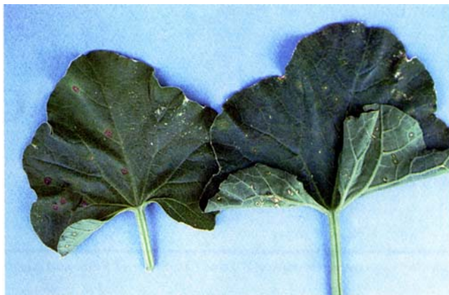
Figure 4. Alternaria leafspot on cantaloupe leaves.

Symptoms of Alternaria leaf spot are small circular spots which may have a dark-green margin, called water-soaking, and enlarge to 1/2 inch or more across. Concentric rings appear in the spots as they enlarge, giving a "target spot" appearance. Fruit is seldom attacked unless plants are nutrient deficient. The pathogen overseasons on infected plant debris and spores are wind-borne and rain-splash dispersed. If Alternaria leaf spot is a recurrent problem in your garden, you might have to apply broad-spectrum fungicide every 7-10 days in order to protect plants. Consult with the UF IFAS Cooperative Extension Service for recommended fungicides. See Plant Pathology Fact Sheet PP-32: "Alternaria Leaf Spot of Cucurbits".