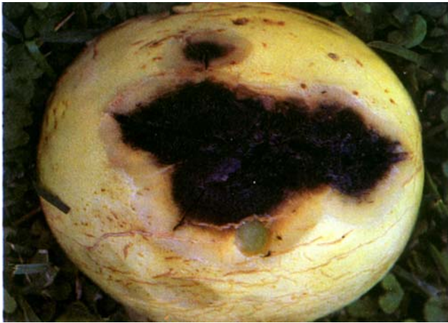
Figure 9. Gummy stem blight lesions (young and old) on honeydew melon fruit.