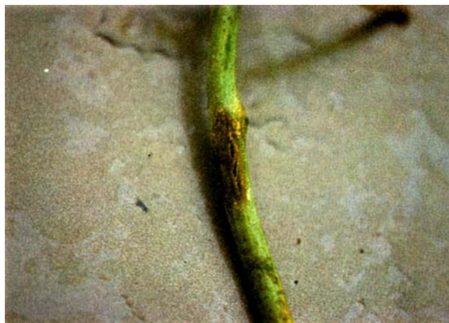
Figure 8. Gummy stem blight lesion on cantaloupe vine.

stem blight. The causal fungus can often be observed to reproduce on the crowns or stem lesions and will produce small black specks (pycnidia) in the plant tissue. The fungus over-seasons on old plant debris and can be seedborne. The pathogen is spread by splashing rain from plant to plant, or can be carried long distances on wind currents. To control this disease, start with seeds or transplants that are disease-free. Avoid planting in the same location if youve had a problem with this disease on your cucurbits in previous seasons. Consult with the UF IFAS Cooperative Extension Service for recommended fungicides. See Plant Pathology Fact Sheet PP-27:"Gummy Stem Blight of Cucurbits".