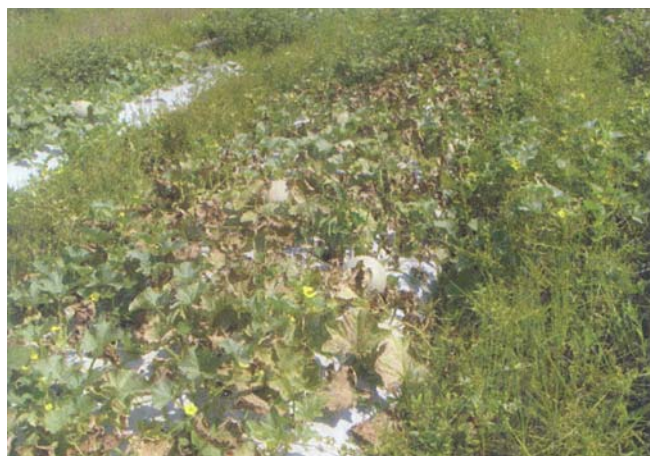
Figure 7. Severe symptoms of downy mildew on cantaloupe in field.

On young seedlings, Gummy stem blight symptoms appear as lesions on the cotyledons and true leaves that are round or irregular, brown, with faint concentric rings. Lesions in stems and fruit are brown, usually turn white with age and may ooze or bleed an amber plant fluid: hence the name "gummy"