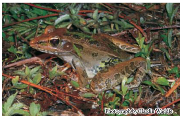
Figure 5. The southern leopard frog, Rana sphenocephala , a relatively large frog that frequents the shallow edges of grassy wetlands and flooded cypress forests in southern Florida. This is a species that will likely see a shift in the range during Everglades restoration.

a hydrologic gradient from very long hydroperiod sloughs to the extremely short hydroperiod rocky glades of eastern Everglades National Park. The outcome of this research will be community profiles relating the PAO of several key amphibian species to the ecological community along this gradient. This information can then be used by managers to make predictions and monitor success of CERP (Figure 6).