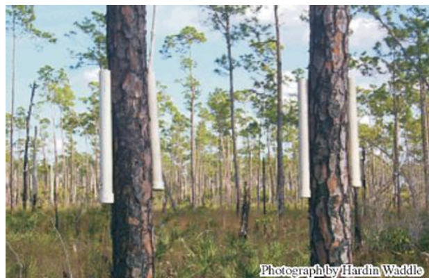
Figure 4. Polyvinyl chloride (PVC) pipes used as artificial refugia to capture treefrogs in a pine forest in Everglades National Park.

Amphibians are present in all habitats and under all hydrologic regimes in the Everglades. The species present and occupancy rates—the proportion of an area, or habitat, occupied (PAO) by a particular species—differ greatly across those gradients. These differences are due to hydropattern, vegetation, and other environmental factors. The combination of species composition and proportion of each habitat occupied at a given time form unique communities defined by those environmental factors. Therefore, if these communities can be reliably defined and measured, the Everglades restoration success can be evaluated, restoration targets can be established, and restoration alternatives can be compared.