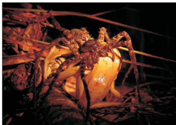
Figure 1. An Okefenokee fishing spider ( Dolomedes okefinokensis ) digesting a green treefrog ( Hyla cinerea ) in a cypress dome in Big Cypress National Preserve. This is one of a few documented cases of arthropods as predators of frogs.

Declines in amphibian populations have been documented by scientists worldwide from many regions and habitat types (Alford and Richards 1999). No single cause for declines has been demonstrated, but stressors such as acid precipitation, environmental contaminants, non-native predators, disease agents, parasites, and the effects of ultraviolet radiation have all been suggested. Because of their susceptibility to these and other stressors, amphibians are important indicators of ecosystem health (Welsh and Ollivier 1998).