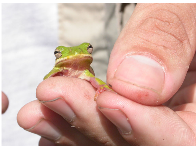
Figure 2. Green Treefrog ( Hyla cinerea ) captured in the marsh in Big Cypress National Preserve.

The Green Treefrog ( Hyla cinerea ) and Squirrel Treefrog ( Hyla squirella ) were the most commonly observed amphibian species during our recent inventories of Everglades National Park and Big Cypress National Preserve. These species were found in all habitats that we surveyed (Figure 3). While occurring together in many cases, the relative density