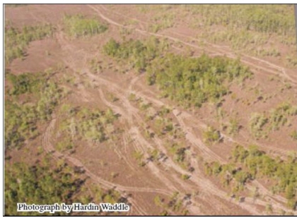
Figure 8. Trails left by off-road vehicles in the prairie habitat of Big Cypress National Preserve.

Meshaka, W.E. 2001. The Cuban Treefrog in Florida . Gainesville: University of Florida Press.