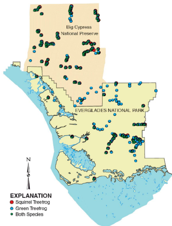
Figure 3. Location of Green Treefrogs ( Hyla cinerea ) and Squirrel Treefrogs ( Hyla squirella ) within Everglades National Park and Big Cypress National Preserve.

Treefrog ( Osteopilus septentrionalis ) on native treefrog populations. Cuban Treefrogs have been shown to be a predator of at least six species of native frogs and toads (Meshaka 2001) and at least one native snake (Maskell and others, 2003), and the Cuban Treefrog has become established in natural areas within Everglades National Park. We monitored populations of both native and the introduced species using capture data from artificial refugia (Figure 4). After one year of monitoring, all Cuban Treefrogs captured were removed from the area, and the recovery of native frogs was monitored. Results from this study indicated that Cuban Treefrogs can cause severe reductions in native treefrog abundance and survival in areas where Cuban Treefrog abundance is high. This estimation approach could also be applied to other stressors of amphibian populations, including alteration of the hydrologic cycle.