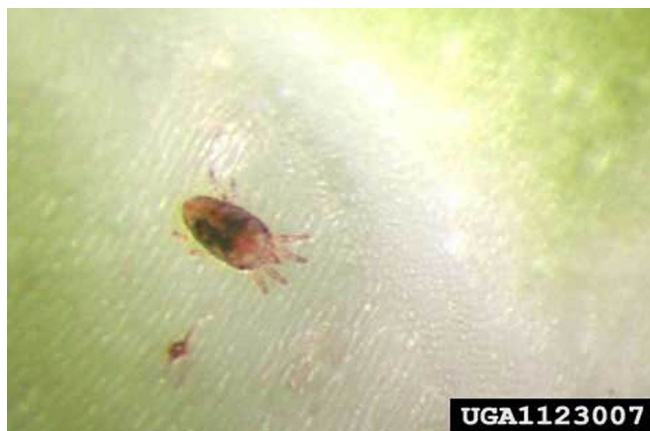
Figure 1. Adult false spider mite, Brevipalpus sp.

Brevipalpus californicus (Banks), sometimes called the "omnivorous mite" in the U.S., has an extensive host range and may cause economic damage, depending on the host. Mites in the family Tenuipalpidae are called false spider mites (they do not spin a web) or flat mites.