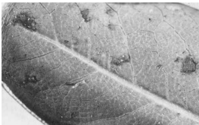
Figure 4. Injury to pittosporum leaf caused by false spider mite, Brevipalpus sp.

Brevipalpus mites inject toxic saliva into fruits, leaves, stems, twigs, and bud tissues of numerous plants including citrus. Feeding injury symptoms on selected plants include: chlorosis, blistering, bronzing, or necrotic areas on leaves (Childers et al. 2003). Injury to Pittosporum sp. is shown below.