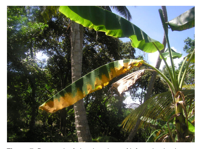
Figure 7. Banana leaf showing signs of infestation by the red palm mite, Trinidad, 2006.