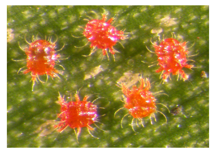
Figure 4. Females of R. indica on the underside of a palm frond.