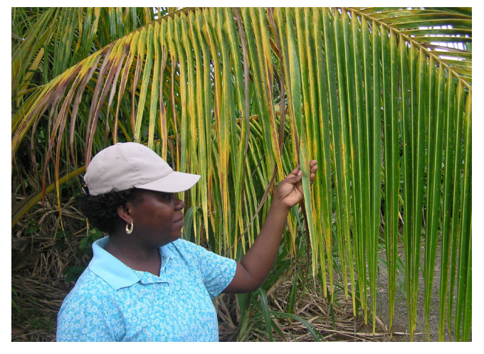
Figure 1. Coconut palm frond showing chlorosis and necrosis of the pinnae, Dominica.

damage has sometimes been misdiagnosed in the field as lethal yellowing (LY), a highly prevalent disease of palms in southern Florida and various countries of the Caribbean Basin. Like the effects of red palm mite feeding, LY infection results in extensive chlorosis of the lower leaves. However, in a very early stage of LY disease, the emerging inflorescences become distorted and the male flowers, normally of an ivory, yellow, or orange color depending on variety, turn to the color of coffee grounds, and the coconuts of all stages of development drop from the tree. Of course, a key symptom that distinguishes red palm mite damage from LY is the presence of dense populations of a red mite visible with the naked eye on the abaxial surfaces of older foliage. The exuviae (cuticle tissue discarded at molting) of red palm mites may be present as scaly patches on the leaf surface.