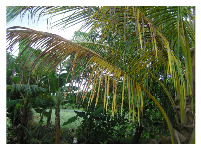
Figure 2. Chlorosis and necrosis of pinnae appears to be more pronounced on basal fronds of coconut palms in the island of Dominica.

Males and females were described by Sayed (1942). Adult female red palm mites are red, typically with dark patches on the body, and about 0.32 mm long. Males are smaller than females and triangular in form. Dorsal setae are present on both sexes. The body of the red palm mite does not have a striae. The first pair of dorsocentral hysterosomal setae is longer than the others; the fourth pair of dorsosublateral setae is shorter than the first pair. All dorsal body setae are slightly clublike and serrate. The larvae are reddish and sluggish. The minute eggs (0.09 mm x 0.12 mm) are oblong smooth and red and