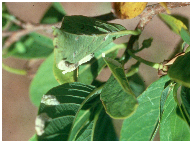
Figure 4. Philephedra tuberculosa infesting atemoya.

In Florida, the scales, Parasaissetia nigra , Saissetia coffeae , S. oleae and Philephedra tuberculosa cause damage by feeding on sap. Sudden increases in populations of these insects coincide with plant stress and absence of effective natural enemies.