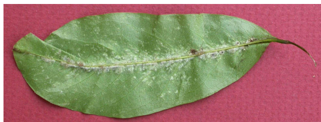
Figure 8. Leaf of soursop infested with Aceria annonae .

Brevipalpus phoenicis affects up to 85% of the epidermal surface of unripe soursop fruit. The fruit becomes bronze colored with darker epidermal cracking and lighter striations, resembling rust. The eriophyid Aceria annonae infests leaves of soursop and pond apple. There are no records of its economic damage or control.