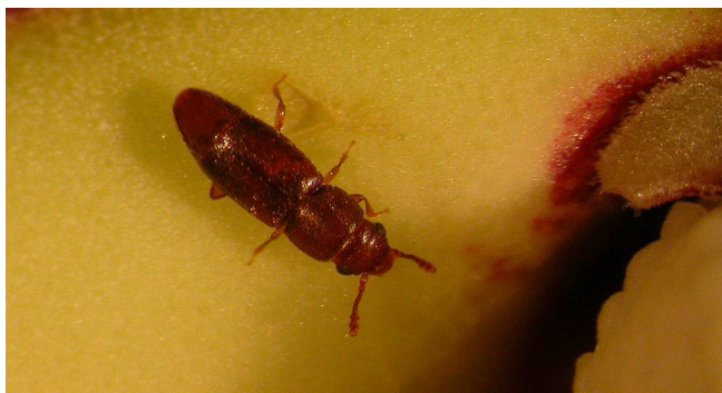
Figure 1. Sap beetle entering an atemoya flower.

are Coccidae (Homoptera), Noctuidae, Oecophoridae (Lepidoptera), and Eurytomidae (Hymenoptera). The most common species in Florida are Bephratelloides cubensis , (Hymenoptera: Eurytomidae), Cocytius antaeus (Lepidoptera: Sphingidae), and the papaya scale Philephedra tiuberculosa . Larvae of the moths, Gonodonta nutrix and G. unica feed on leaves, but they are heavily parasitized by braconid wasps.