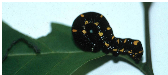
Figure 6. Larva of G. nutrix .

In Florida, larvae of the fruit piercing moths, Gonodonta nutrix and G. unica feed on tender leaves. They do not cause significant damage because they are heavily parasitized by a braconid wasp.