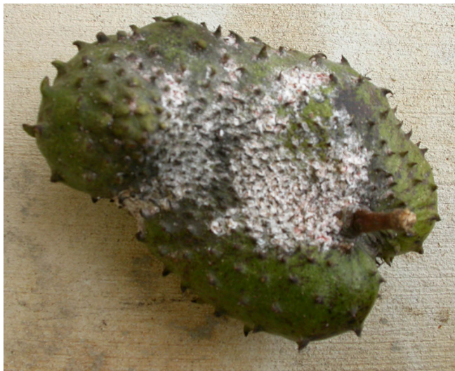
Figure 5. Pink hibiscus mealybug infestation on soursop.

The pink mealybug, hibiscus mealybug Maconellicoccus hirsutus (Green), cause severe damage to soursop. Maconellicoccus hirsutus is an extremely polyphagous species. It affects at least 74 plant families, about 144 genera. Some major hosts include mango, hibiscus, palms, coffee, grape, citrus and Annona spp.