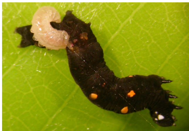
Figure 7. G. nutrix parasitized by a braconid.