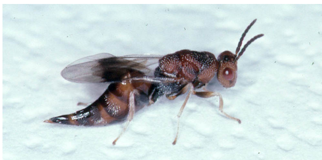
Figure 2. Adult of the annona seed borer.

Bephratelloides spp. develop strictly in Annona seeds. Economic damage occurs when the adults chew their way out of the fruit, creating a 2 mm diam tunnel that provides entry for other insects and decay organisms. Bephratelloides cubensis is thelytokous, reproducing without males. It has approximately 4-5 generations per year. The egg stage lasts 12 to 14 days, the larval stage 6-8 weeks, the pupal stage 12-18 days, and the adult rarely lives beyond 15 days.