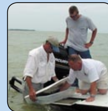
Fishermen should transport fish using shallow plastic fish boxes.