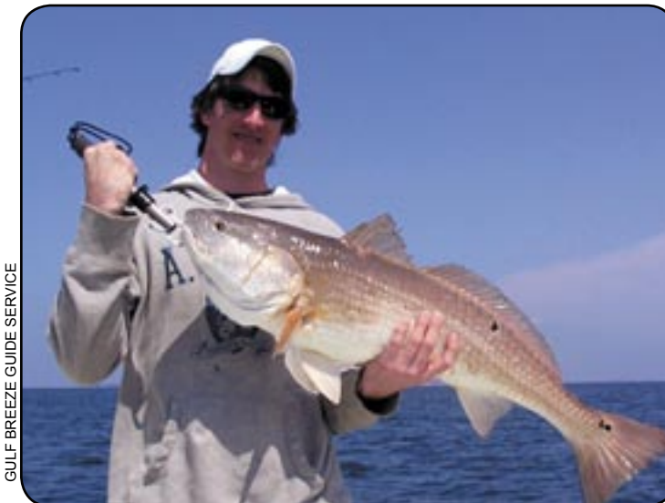
IMPORTANT: The proper use of BogaGrips® requires supporting the belly of the fish and keeping the fish in a horizontal position. Holding the fish vertically will tear mouth and jaw cartilage and cause internal damage.

regularly and responds to external stimulus such as a hand waved over the tank.