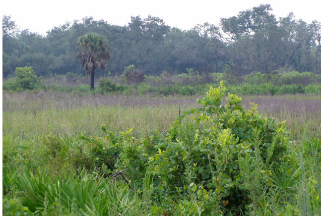
Figure 2. Healthy quail populations require small patches of nesting cover (bunchgrasses), foraging habitat (weeds), and escape cover (shrubs) mixed among each other, like patches in a quilt—often referred to as the Crazy-Quilt. Credits: W.M. Giuliano. (2005).

increases, typically dominate these systems (Figure 3). In Florida, these often include creeping and chalky bluestem, lopsided Indiangrass, switchgrass, and maidencane. Most rangeland systems in this condition typically have relatively few species of forbs (broad-leaved, herbaceous plants) and sparsely-distributed, low-growing shrubs. Some Florida rangelands are an exception to this general rule, because the dominant or co-dominant native grass is wiregrass, which may dominate the range in the absence of grazing, and maintains or increases its dominance with moderate levels of grazing. While these types of areas provide excellent nesting cover for quail, they are poor-fair in the foraging and escape cover necessary for abundant quail populations.