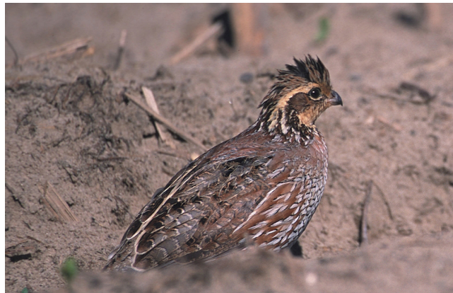
Figure 1. Bobwhite quail.

Applied properly, grazing can create and maintain quality quail habitat, which includes small patches of nesting cover (warm-season, bunchgrasses such as bluestems), foraging habitat (weeds such as ragweed), and escape cover (shrubs such as saw palmetto) mixed among each other, like patches in a quilt. This is often referred to as the Crazy-Quilt and is necessary for healthy and abundant quail populations (Figure 2).