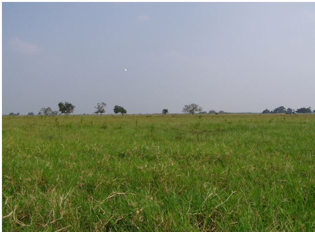
Figure 6. Most bobwhite use of improved or tame grass pastures occurs on the periphery, where birds have access to more abundant food and cover (particularly shrubs for escape), reducing the total useable habitat for quail and the overall number of birds on a ranch.

is a bunchgrass that is similar to our native grasses in structure, it may provide good nesting habitat. However, given that foraging and escape cover are usually not present in the pasture, it will receive little or no use because the birds prefer to nest within a short walk or flight from feeding and escape cover (typically less than 200 feet). Therefore, most quail use of improved pastures occurs on the periphery, where birds have access to food and cover, reducing the total useable habitat for bobwhites and the overall number of birds on a ranch (Figure 6).