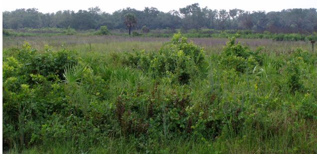
Figure 7. Livestock and quail can coexist on Florida's pastures rangelands. In fact, applied properly (that is at moderate intensities), grazing may be the best tool to create the Crazy-Quilt habitat necessary for healthy and abundant quail populations.

Ironically, “improving” pastures for cows through intensive management, and converting native vegetation to tame grass pasture is not an improvement at all for the bobwhite. However, there are techniques, even for tame grass pasture, that benefit quail and will allow cows and quail to coexist—the key is to create and maintain a Crazy-Quilt (Figure 7).