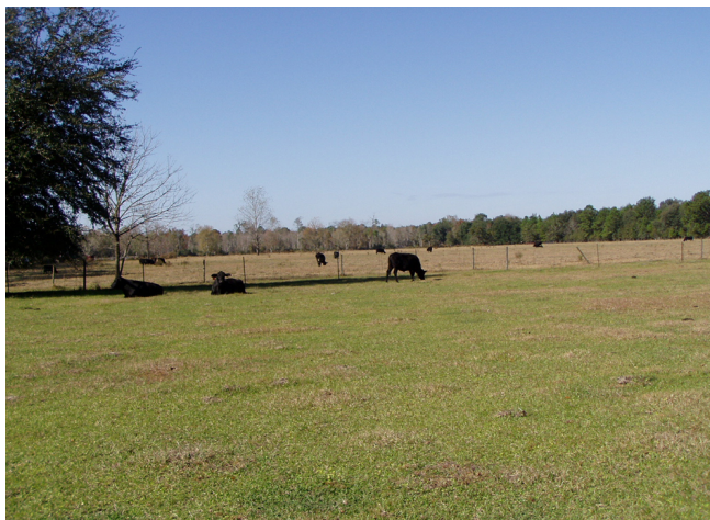
Figure 5. Heavy grazing, particularly when shrubs and other non-forage plants are being controlled, may lead to the typical “golf course effect,” providing little forage for cattle and no food or cover for quail. Credits: W.M. Giuliano. (2006).

Alternatively, heavy grazing, particularly when invaders are being controlled, may lead to the typical “golf course effect,” providing little forage for cattle and no food or cover for quail (Figure 5).