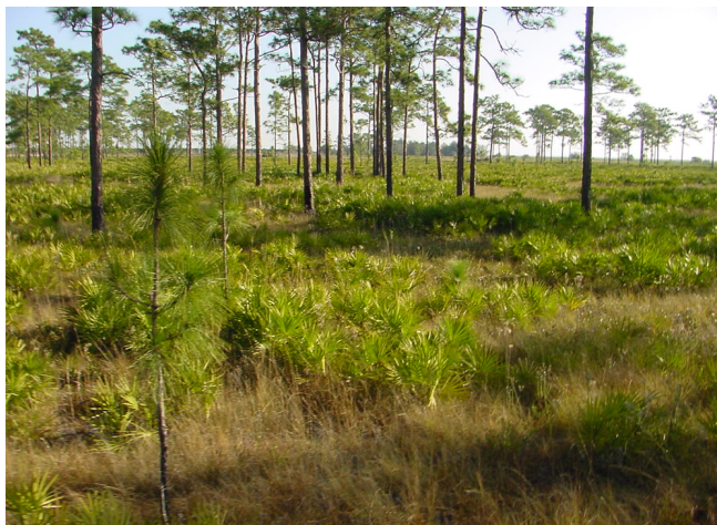
Figure 4. Heavy grazing, when non-forage species are not being controlled through prescribed fire and other treatments, often removes native grasses and weeds, allowing shrubs such as saw palmetto to dominate the range. While this situation provides excellent escape cover conditions for bobwhites, it provides little or no nesting habitat and will result in low quail numbers. Lacking most grasses, these areas are also poor in forage condition for livestock. Credits: W.M. Giuliano. (2004).

cover conditions and fair-good forage conditions for quail, it provides little or no nesting habitat and will result in low quail numbers. Lacking most grasses, these areas are also poor in forage condition for livestock (Figure 4).