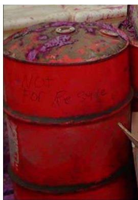
Figure 1. Pesticide drum bulging from extreme heat.

effectiveness is most often reduced by the presence of moisture in storage. These products have a high affinity for water and once absorbed, may solidify into hard masses, like tombstone formation. The packaging that surrounds dry products formulated as water-soluble packets can become brittle after taking on moisture; and if freezing occurs, they can break when handled.