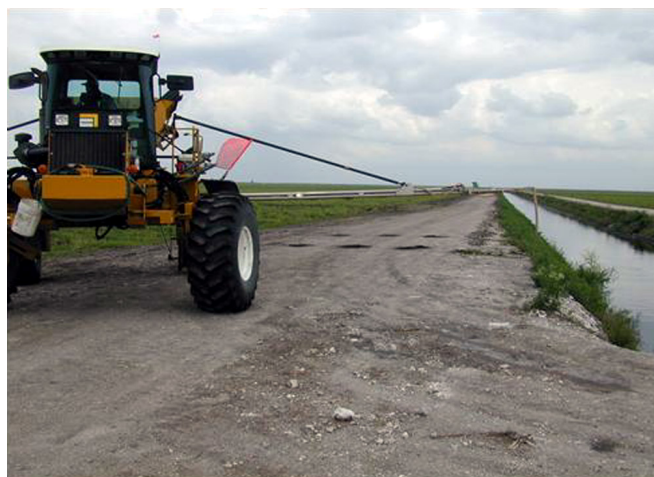
Figure 5. Reduce speeds when turning to avoid misapplication to roads, canals, and ditches.