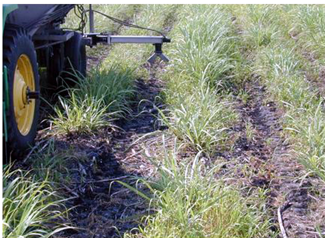
Figure 1. Band application of P fertilizer increases P use efficiency by the crop.