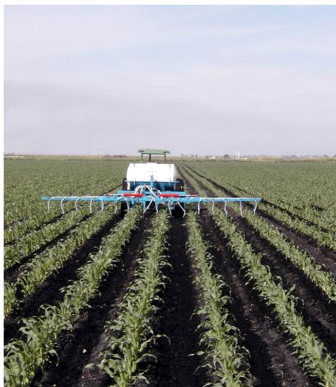
Figure 3. Banding reduces application rates and the likelihood of re-application to the same row.

important for vegetable production on the organic soils of the EAA. Sanchez et al. (1990) reported that banding can reduce the amount of P fertilizer applied to lettuce by 66% compared to broadcast application. Banding is also a viable strategy to reduce the amount of P used in sweet corn production on organic soils (Sanchez et al., 1991), since it provides a method to achieve profitable sweet corn production while minimizing environmental risks.