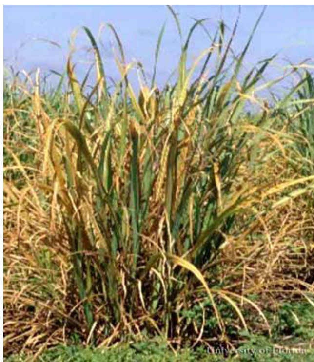
Figure 6. Damage to sugarcane plant in field, by yellow sugarcane aphids, Sipha flava (Forbes).

Parasitism by native parasitic wasps occurs rarely and none are known in Florida. An aphidiid parasitoid collected from France, Adialytus ambiguus (Haliday), was released and subsequently established in Hawaii in 1991 where it initially killed less than 10% of the yellow sugarcane aphids (Anon). Temperatures above 95°F and heavy rainfall from