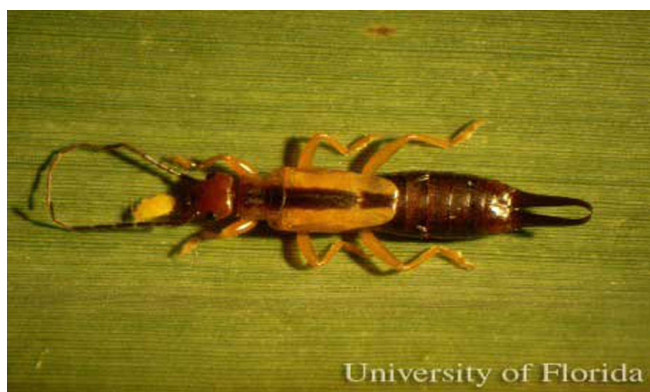
Figure 9. Male Doru terminatum earwig feeding on yellow sugarcane aphid, Sipha flava (Forbes), on sugarcane, Saccharum officinarum .

leaf yellowing and death. Insecticides are available that provide effective S. flava control (Nuessly and Hentz 2002b) should natural enemies or weather fail to keep populations in check. Timing of insecticide treatment is critical to avoid yield or stand loss. Aphid numbers quickly build to numbers too large to count for sampling purposes. Sugarcane leaf damage symptoms are a good indicator of season long growth and yield effects and works without having to count aphids. An infestation that leaves just four live leaves beneath the top visible dewlap leaf (youngest fully developed leaf) with more than 50% green tissue (i.e., average of two to three badly damaged leaves) is still enough to reduce sugar content at harvest by up to 6%. Significantly greater yield reductions occur