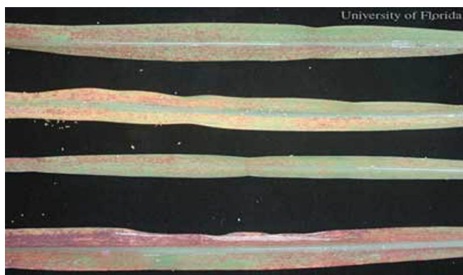
Figure 4. Sugarcane, Saccharum officinarum , varietal responses to yellow sugarcane aphid, Sipha flava (Forbes), feeding: yellowing, reddening, necrosis.