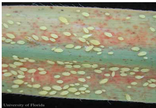
Figure 3. Yellow sugarcane aphids, Sipha flava (Forbes), on sugarcane, Saccharum officinarum .

Wingless yellow sugarcane aphid adults and nymphs are straw to bright yellow to light green in color with two double rows of dusky colored spots down the top of the abdomen. Rows of spots are also present along the lateral margins of the abdomen. Yellow sugarcane aphids are yellow on sugarcane. S. flava is covered with short, stiff hairs. The cornicles (siphunculi) are reduced to slightly elevated pores. Adult females can be separated from large third instar nymphs by the presence of a small, rounded, knobby cauda adorned with several hairs at the end of the adult abdomen. Winged and wingless adults are 1.3 to 2.0 mm long. Winged females have yellow abdomens with the same spots described above and darker head and thorax than wingless females.