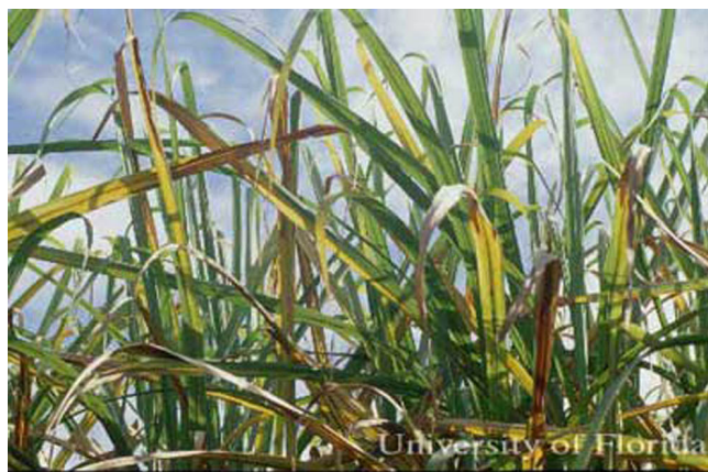
Figure 7. Yellow sugarcane aphid, Sipha flava (Forbes), damage to tops of late season sugarcane, Saccharum officinarum . Credits: Gregg S. Nuessly, University of Florida

summer storms also are effective at reducing yellow sugarcane aphid populations.