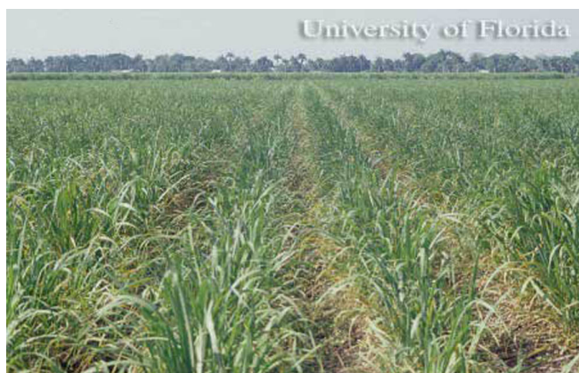
Figure 5. Yellow sugarcane aphid, Sipha flava (Forbes), damage to young sugarcane, Saccharum officinarum . Note yellow leaves displayed as stripes from field edge.