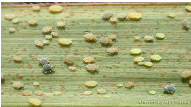
Figure 2. Mixed colony of white, Melanaphis sacchari , and yellow, Sipha flava (Forbes), sugarcane aphids on sugarcane, Saccharum officinarum .

Interestingly, S. flava does not produce an alarm pheromone, but it responds to the alarm pheromone of M. sacchari by quickly falling from the plant.