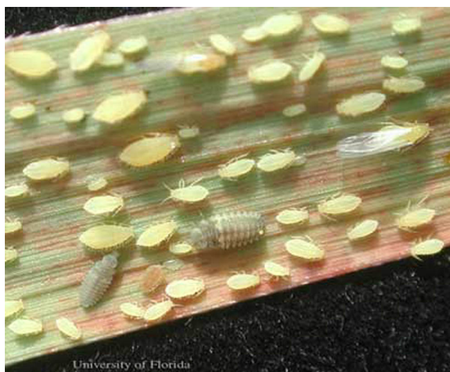
Figure 8. Diomus terminatus ladybird larvae feeding on yellow sugarcane aphids, Sipha flava (Forbes), on sugarcane, Saccharum officinarum .