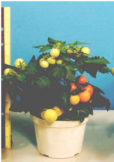
Figure 2. 'Micro-Gold' miniature dwarf tomato.

Foliage chlorosis and deterioration has been a problem with many yellow-fruited, dwarf breeding lines. Leaves are smaller than those of typical dwarf cultivars but slightly larger than those of 'Micro-Tom'.