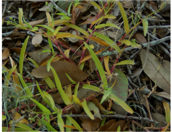
Figure 3. Doveweed stems. Note—the creeping stems resemble a grass.

The stems of the plant may not be visible, especially when growing in a dense mat. However, the stems are succulent, round, and smooth, and they root extensively along the nodes. The stems may be purplish to reddish in color (Figure 3). The leaves have parallel venation and are 2 to 5 inches long, 0.25 to 0.5 inches wide, narrow, pointed, spirally arranged, and clasp the stem (Figure 4). When young, doveweed is often misidentified as a grass. Leaf sheaths have soft hairs on the upper margins. Doveweed shoots often have a shiny appearance compared to other weed species.