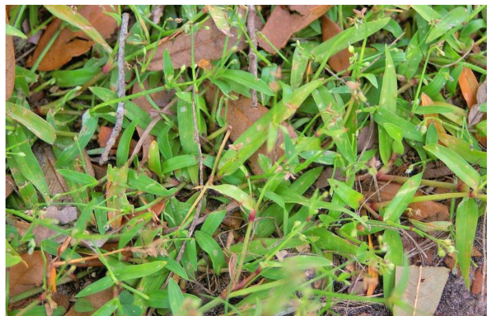
Figure 4. Doveweed leaves.