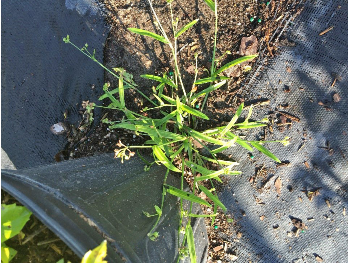
Figure 1. Doveweed plant growing through torn weed fabric.

Doveweed is usually a low-growing, creeping annual with leafy or succulent branches. Stems may be either erect (upright) or semi-erect up to 12 inches tall, but doveweed usually does not reach this height (Figure 1). Doveweed forms dense mats by rooting along its nodes when the nodes are in contact with the soil.