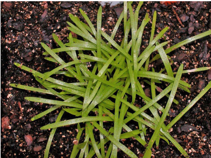
Figure 2. Grass-like doveweed seedling.

Germination begins during the onset of warm and wet weather, typically around April or May in Florida, and continues throughout the summer. The leaves of young plants grow in a circular arrangement (rosette). The creeping stems are succulent, root along the nodes, and are grass-like. (Figure 2)