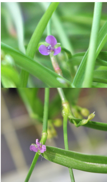
Figure 6. Doveweed flowers.

The flowers are stalked and form in small clusters from midsummer throughout the fall. They are short-lived, in terminal or axillary long-stalked inflorescences (Figure 6). Flowers are blue or purple in color with 3 sepals and 3 petals that are 0.2 to 0.5 inches long. It has three to four sterile stamens (pollen-bearing organ of a flower) with long bearded filaments and bluish-colored anthers.