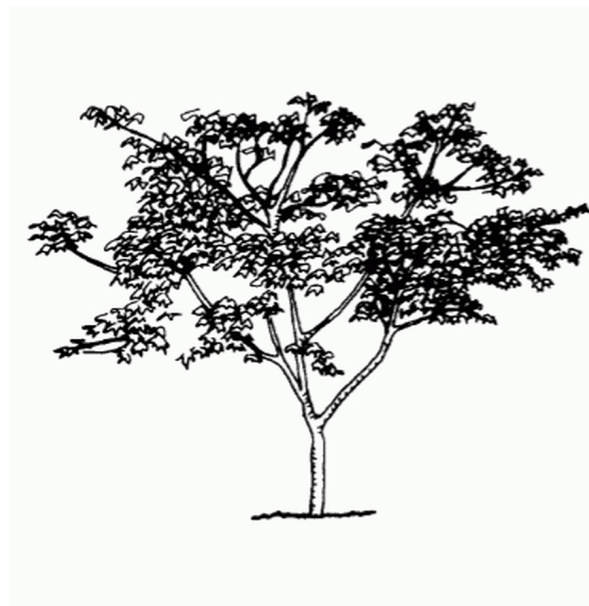
Figure 1. 'Vitifolium' full-moon maple.

Full-moon maple is a small, deciduous tree that reaches 10 to 15 feet in height and width, creating a smooth, rounded canopy (Figure 1). It fits well into the oriental garden due to the exotic silhouette. The deeply divided, soft green leaves have 9 to 11 lobes and are delicately displayed on thin, drooping branches. The cultivar 'Vitifolium' leaves are less divided, providing a coarse texture in the landscape. Leaves take on a beautiful yellow to red coloration in the fall before dropping, making this small, dense plant really stand out in the landscape. Fall color has been described as exceptional. The hanging clusters of showy, purple/red flowers appear in late spring and are followed by the production of winged seeds. The flowers stand out among the maples.