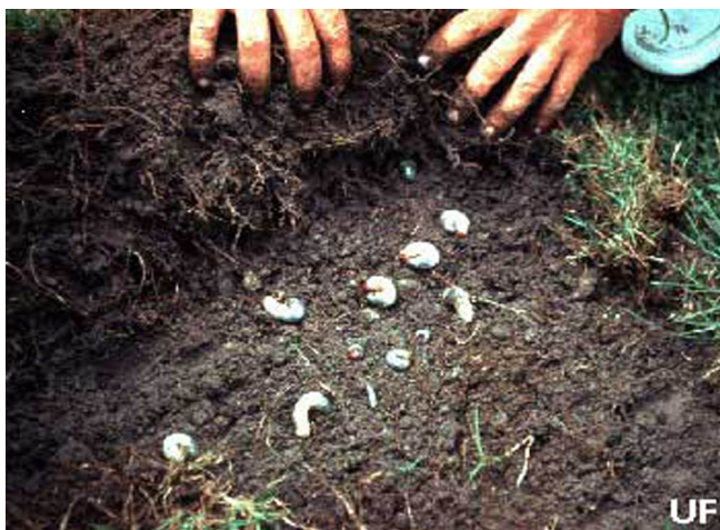
Figure 7. Counting larvae of the adult hunting billbug, Sphenophorus venatus vestitus Chittenden, and white grubs of the genus Phyllophaga .

For more information, please see :Insect Management Guide for Turfgrass ( http://edis.ifas.ufl.edu/ TOPIC_GUIDE_IG_Turf_and_Ornamentals ).