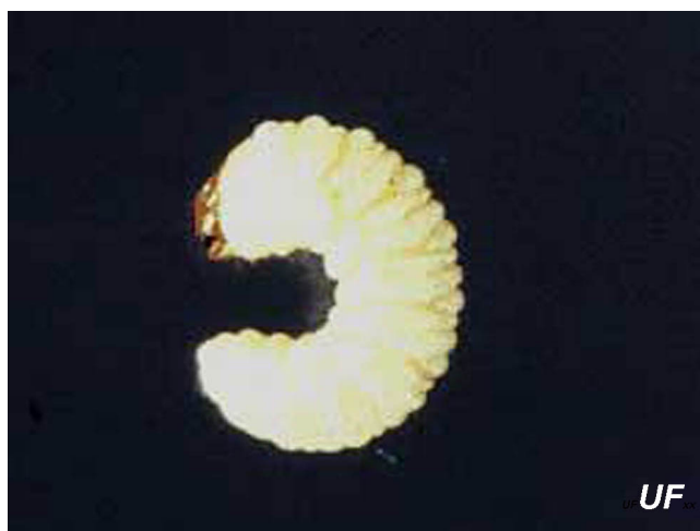
Figure 2. Larva of the hunting billbug, Sphenophorus venatus vestitus Chittenden.