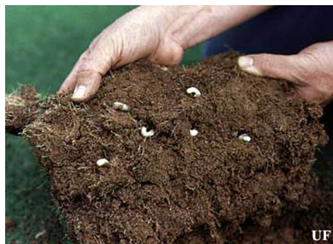
Figure 6. Inspecting for larvae of the adult hunting billbug, Sphenophorus venatus vestitus Chittenden, and white grubs of the genus Phyllophaga .

To inspect for billbugs or grubs, cut three sides of a one foot square piece of sod about two inches deep with a spade under the sod and lay it back. See if the grass roots are chewed off and sift through the soil to determine if larvae are present. Replace the strip of sod. Inspect several areas in the lawn. As a rule of thumb, if an average of ten billbugs is found per square foot, apply an insecticide.