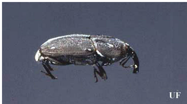
Figure 1. Adult hunting billbug, Sphenophorus venatus vestitus Chittenden.

The hunting billbug, Sphenophorus venatus vestitus Chittenden, is a weevil that is also commonly known as the "zoysia billbug" in Florida, where it has been reported as a pest of various grasses, especially in nurseries. Billbug larva are often confused with white grubs, which is the name usually given to beetle larvae in the genus Phyllophaga , family Scarabaeidae.