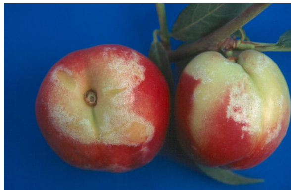
Figure 4. Scarring and corky tissue on nectarines resulting from thrips feeding

Silvering is common, due to air entering cells from which the contents have been removed, and on fruits this leads to scarring and corky tissue development (Figure 4).