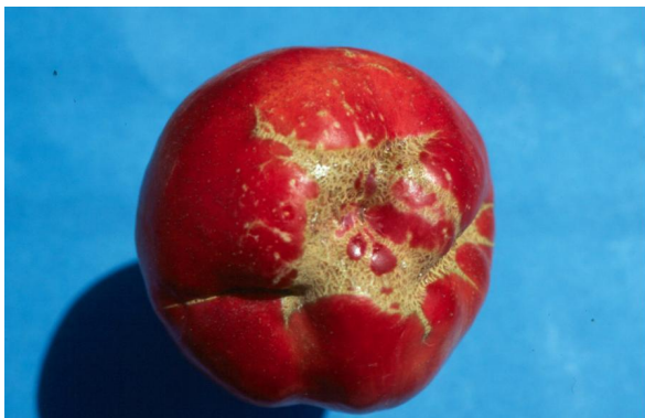
Figure 2. Deformity on nectarine from thrips feeding

Thrips induce a range of symptoms in plant tissue by their feeding (Childers 1997). On small fruits, feeding results in deformity (Figure 2).