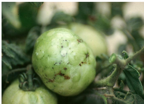
Figure 7. Symptoms on tomato infected by tomato spotted wilt virus. Credits:

The tomato spotted wilt virus has a worldwide distribution, with a host range of over 926 species (Figure 7). Most susceptible plant species belong either to the Compositae family, of which 213 species are susceptible, or the Solanaceae family, of which 168 species are susceptible. More detailed information on the biological and molecular aspects of the tomato spotted wilt virus, including a list of host plants, can be found at the website address, http://www.dpw.wageningen-ur.nl/viro/research/tospo.html .