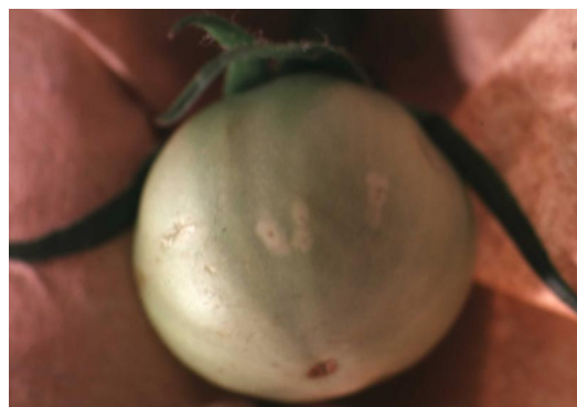
Figure 5. Dimpling resulting from thrips egg-laying

The western flower thrips lays eggs in the small fruits in the flower. Eggs are laid individually resulting in a small dimple sometimes surrounded by a white halo on mature fruit. For fruits such as tomato, this dimpling can result in the culling of individual fruits or even downgrading of the crop (Figure 5).