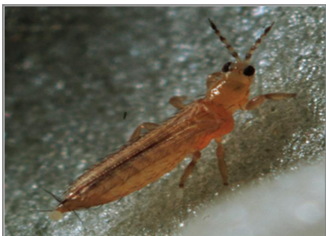
Figure 1. An adult flower thrips (actual length about 1/10 inch). Photo: Cheryle O'Donnell Credits:

There are about 5,000 described species of thrips (insects in the Order Thysanoptera) (Moritz et al. 2001; Mound 1997). Most feed on fungi and live in leaf litter or on dead wood. The species that feed on higher plants occur mostly in the Family Thripidae (Figure 1). This family includes the important pest species. Some reproduce in flowers and feed on the cells of the flower tissues, on pollen grains, and on small developing fruits. Many of the flower-living species are partly predatory. Other species primarily feed on leaves. Some species are predators on small insects. Some of the most common pest species feed on a wide range of plants and even prey on mites.