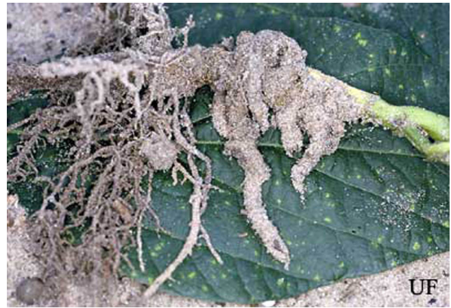
Figure 3. Soil tubes formed by the lesser cornstalk borer, Elasmopalpus lignosellus (Zeller).

The egg stage is difficult to sample because eggs are small and resemble sand grains. Eggs can be separated by flotation, however. Larval populations are aggregated, and can be separated from soil by sieving or flotation (Mack et al. 1991). Adults are attracted to light traps, but are difficult to monitor with this technique because the moths of lesser cornstalk borer are difficult to distinguish from many other species. This is especially true of the females, which are less distinctive than the males. Pheromone