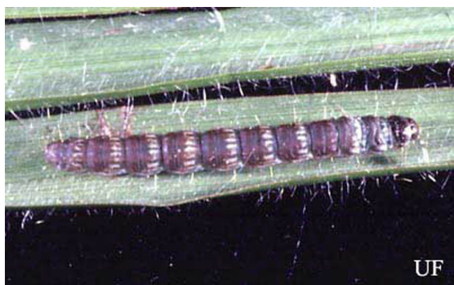
Figure 1. Mature larva of the lesser cornstalk borer, Elasmopalpus lignosellus (Zeller).

tunnels. The cocoon measures about 16 mm in length and 6 mm in width. The pupa is yellowish initially turning brown and then almost black just before the adult emerges. It measures about 8 mm long and 2 mm wide. The tip of the abdomen is marked by a row of six hooked spines. Pupal development time averages about nine to 10 days, with a range of seven to 13 days.