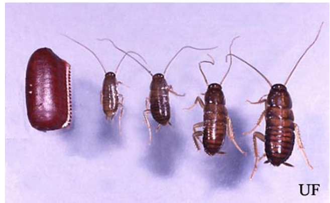
Figure 2. Ootheca and first, second, third and fourth instar nymphs of the American cockroach, Periplaneta americana (Linnaeus).

Females of the American cockroach lay their eggs in a hardened, pears shaped egg case called an ootheca. About one week after mating the female produce an ootheca and at the peak of her reproductive period, she may form about two ootheca per week (Bell and Adiyodi 1981). The females on average produce an egg case about once a month for ten months laying 16 eggs per egg case. The female deposits the ootheca near a source of food by either simply dropping it or gluing it to a surface with a secretion from her mouth. The deposited ootheca contains water sufficient for the eggs to develop without receiving additional water from the substrate (Bell and Adiyodi 1981). The egg case is brown when deposited and turns black in a day or two. A typical egg case contains about 14 to 16 eggs. It is about 8 mm long and 5 mm high.