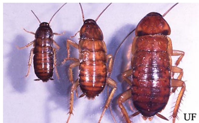
Figure 3. Fifth, sixth and seventh instar nymphs of the American cockroach, Periplaneta americana (Linnaeus).

The nymphal stage begins when the egg hatches and ends with the emergence of the adult. The number of times an American cockroach molts varies from six to 14 (Bell and Adiyodi 1981). The first instar American cockroach is white immediately after hatching then becomes a grayish brown. After molting instars of the cockroach nymphs are white and then become a uniformly reddish-brown with the posterior margins of the thoracic and abdominal segments being a darker color. Wings are not present in the nymphal stages and wing pads become noticeable in the third or fourth instar. Complete development from egg to adult is about 600 days. The nymphs as well as the adults actively forage for food and water.