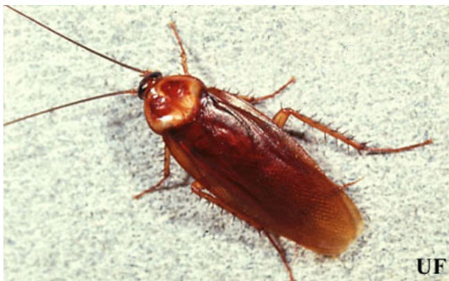
Figure 4. American cockroach, Periplaneta americana (Linnaeus), adult.

The adult American cockroach is reddish brown in appearance with a pale-brown or yellow band around the edge of the pronotum. The males are longer than the females because their wings extend 4 to 8 mm beyond the tip of the abdomen. Males and females have a pair of slender, jointed cerci at the tip of the abdomen. The male cockroaches have cerci with 18 to 19 segments while the female has 13 to 14 segments. The male American cockroaches have a pair of styli between the cerci while the females do not.