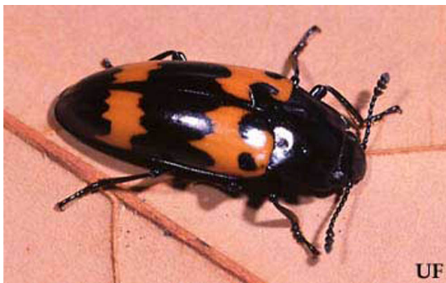
Figure 2. Adult pleasing fungus beetle, Megalodacne spp.