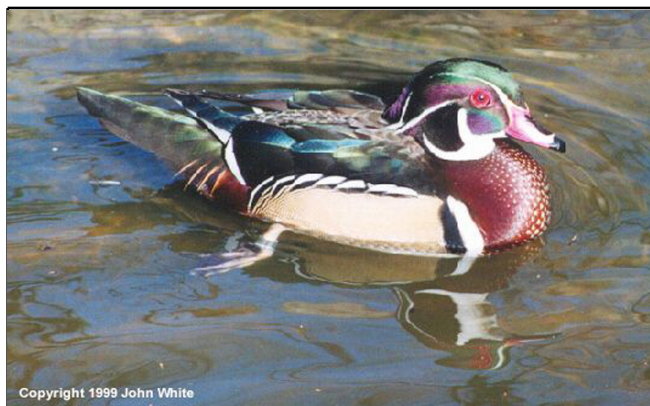
Figure 1. A male wood duck, also known as a drake.

Both drake (male) and hen (female) wood ducks (Figure 2) can be distinguished from other flying ducks by their relatively large head, short neck, and