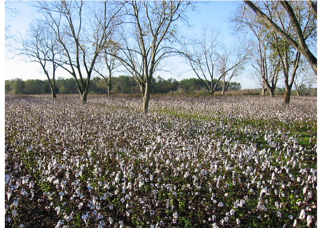
Figure 2. Pecan-cotton alley cropping near Jay, Florida.

similar crop yields from alley cropping and monoculture designs in young systems. As trees mature, however, significant interactions between the tree and crop component can be expected for light, water and nutrients. This may lead to reduced yields of the crop or tree species that should be accounted for in management plans.