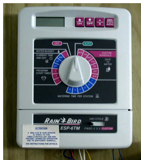
Figure 1. Typical residential irrigation controller.

Generally, electronic controllers allow flexible scheduling of irrigation systems (Figure 1).