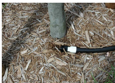
Figure 6. Bubbler.