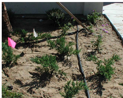
Figure 4. Individual drip emitters.