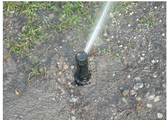
Figure 2. Gear-driven rotor irrigation head.

Although this method is relatively easy, unless it is performed for each zone it will not give the accurate representation of individual zones that is needed to set the controller. For example, rotors (see Figure 2) typically have application rates of 0.25-1.0 in/hr, while spray heads (see Figure 3) have application rates of 0.75-1.5 in/hr. Therefore, these equipment types should be tested separately.