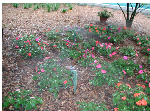
Figure 7. Microjet or microspray.