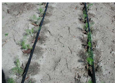
Figure 5. Drip tube or tape.