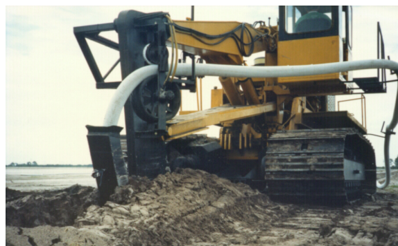
Figure 20. Laying corrugated drainage in citrus bed with plough-type drain installation machine.

water furrows. From Table 1, the minimum spacing for Adamsville is 71 ft at a depth of 46 inches. The drain spacing can increase 6 feet for each inch the drain is installed deeper than 46 inches.