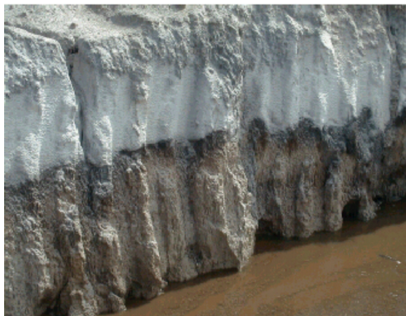
Figure 2. Spodic (organic layer) in Immokalee fine sand series soil.

In order to understand how citrus is damaged by flooding, one needs to understand the soil-water dynamics in a grove. In most Flatwoods soils, a clay or organic layer within 20 to 48 inches of the surface acts as a barrier to downward movement of excess water (Fig. 2). As a result, water must move laterally to be drained from saturated soils.