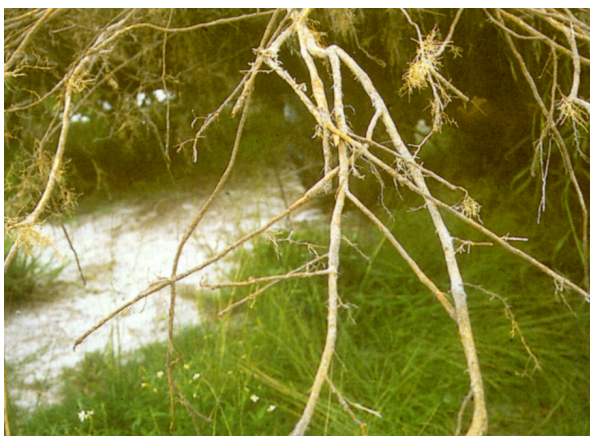
Figure 7. Severely damaged root system with few feeder roots from flatwoods grove.