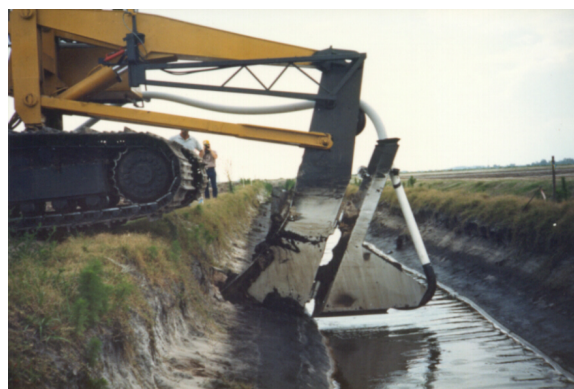
Figure 19. Installing 4-inch corrugated drain tubing with PVC pipe discharge.

Determine drain spacing for an Adamsville fine sand series soil with trees planted at a 25 foot across-row tree spacing on 50 ft wide beds. The tree spacing must be selected so that the drain trench will fall between rows or in the middles of double beds rather than in