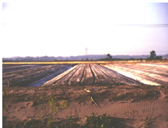
Figure 9. Double-row bed under construction.

Lateral drainage ditches (Fig. 11) should be cut at right angles to the beds and water furrows and