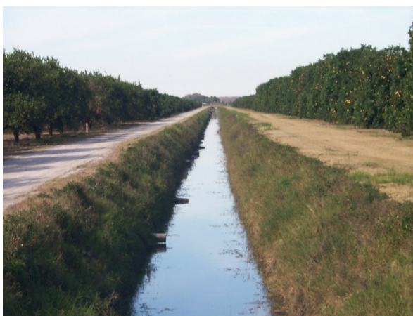
Figure 11. Lateral drainage ditch with water furrow outlet pipes discharging into ditch.

Gravity drainage is preferred if topographic relief allows. However, discharge pumps are required where there is insufficient relief (Fig. 12). Size of the collector ditches and any related pumping facilities is dependent on several factors, such as size of the area being served, soils, bed and water furrow design, and slope of ditches. The surface water drainage system should be designed to remove at least 4 inches per day from the grove.