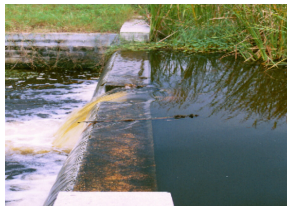
Figure 14. Weir structure used as outfall from water detention area.