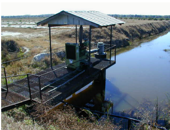
Figure 12. Drainage pump station in citrus grove.

Gravity drainage is preferred if topographic relief allows. However, discharge pumps are required where there is insufficient relief (Fig. 12). Size of the collector ditches and any related pumping facilities is dependent on several factors, such as size of the area being served, soils, bed and water furrow design, and slope of ditches. The surface water drainage system should be designed to remove at least 4 inches per day from the grove.