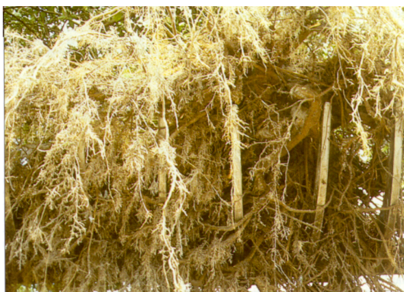
Figure 6. Healthy root system from flatwoods grove.

Fertilization rates and schedules may need to be adjusted for flood-damaged trees. Light ground applied or foliar fertilizer applications on a more frequent schedule are preferred until the root system becomes re-established. Once the immediate drainage problem has been alleviated, the appropriate course of action is to wait, observe, and let tree response guide your actions.