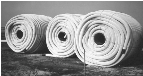
Figure 18. Rolls of 4-inch corrugated drainage tubing.

Corrugated plastic drain tubing has several desirable characteristics. The tubing is light and flexible, weighing about 85 lbs per 250 ft of 4-inch tubing. The tubing allows good alignment in unstable soils. The flexibility of the tubing allows long lengths on each roll with few joints required in the field, making good installations relatively easy (Fig. 18).