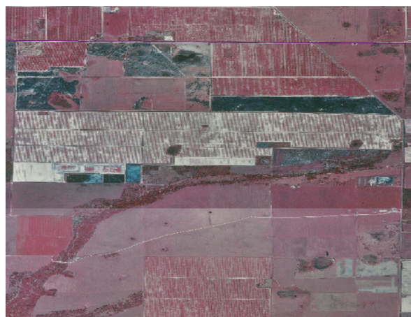
Figure 8. Aerial infrared map showing drainage facilities for grove.

The initial consideration of suitability of a drainage system on a particular area requires a topographic survey. Since most of the Flatwoods citrus areas are either nearly level or of basin-type topography, sufficient slope for gravity outfall probably won't exist. Therefore, a drainage pump for the outlet will most likely be needed. Aerial photographs along with the survey, should facilitate selecting a suitable site for the drainage sump in a low area of the grove (Fig. 8). Before constructing the drainage system, check with the appropriate water management district to ensure that the system will not impact wetlands.