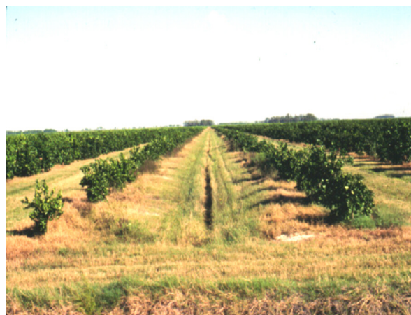
Figure 10. Young trees on double-row bed with water furrow in center.

spaced no further apart than 1320 ft center to center. Topsoil spoil from the ditches can be used to provide fill for low areas in the adjoining fields. Subsoil spoil can provide a grove road base on either side of the lateral ditch. Swales drain into the ditches via 6-8 inch flexible polyethylene or rigid pipe that can be installed either before or after swale construction. A laser level is sometimes employed in this operation, but is not essential. The pipe is installed in the bottom of the water furrow and sloped to discharge approximately 1 ft above the bottom of the ditch. Ditch size will vary depending upon the area served and water management district criteria. In general, lateral ditches should have a minimum of 14-15 ft top width, 4 ft bottom width, 2:1 side slopes, and a depth of at least 5 ft.