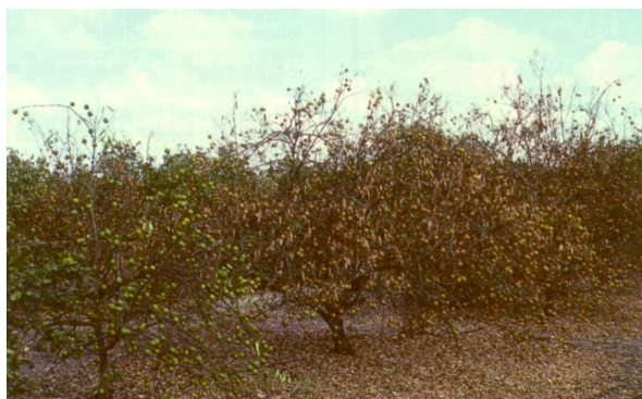
Figure 5. Advanced symptoms of water damage showing extensive defoliation and fruit drop.

Young trees are often more sensitive to flooding and may develop symptoms resembling winter chlorosis. More subtle symptoms include reduced growth and thinner foliage. This can occur at locations only a few inches lower in elevation than the surrounding area. Harvesting operations in a grove even after recent flooding may also further damage surface roots that have been injured by the flooding.