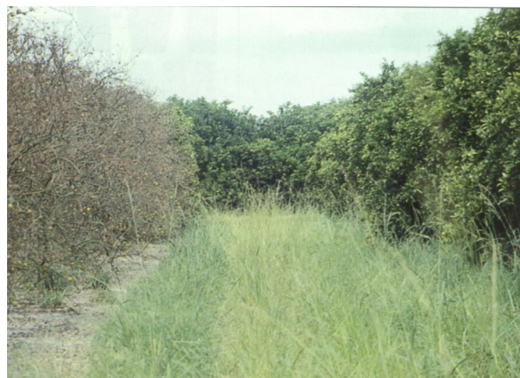
Figure 3. Localized water damage to trees resulting from differences in water table levels.

on isolated areas of flat land, and even on raised beds. Hillsides may have pockets of clay. In flat areas, the problem may be impervious clay, marl, or organic-layered pockets that hold the water and prevent movement. Even beds in apparently uniform sandy areas can have buried palmetto roots and organic materials. These areas are subject to root damage since the soils are able to support bacteria which can quickly generate toxic hydrogen sulfide if flooded. Old pond sites are prone to severe flooding injury. Trees on the periphery of old pond sites are often damaged as much as those in the middle.