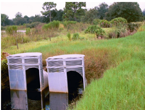
Figure 15. Water control structure used to maintain water level and drainage rate from citrus grove.

Discharges are normally controlled with some type of water control structure where the water depth and discharge rate can be regulated (Fig. 15). In areas prone to erosion or at changes in ditch direction, structures may be required to prevent scouring of banks (Fig. 16).