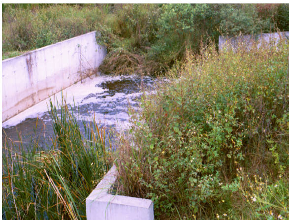
Figure 16. Erosion control structure on grove discharge canal.