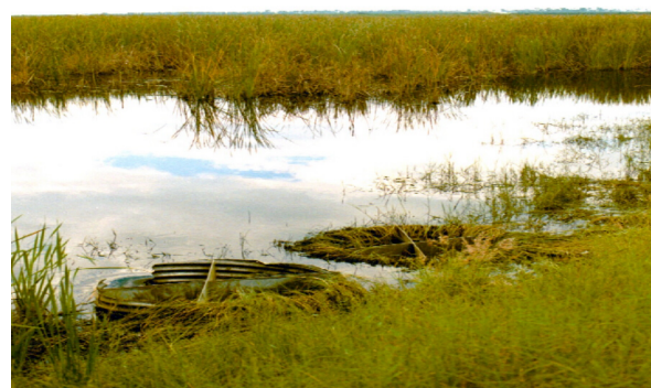
Figure 13. Water detention area within citrus grove.

Runoff rates are reduced by designing surface water detention areas that are interspersed between the grove area and the ultimate off-site discharge points. Typically these are diked off areas that receive inflow from the grove area either via gravity or pumped discharge (Fig. 13). Outflow from the detention areas (often called reservoirs) passes through discharge structures (Fig. 14) that are designed to restrict the flow rate to pre-development peak rates. Water levels thus build up in detention areas for a short period of time following major rainfall events.