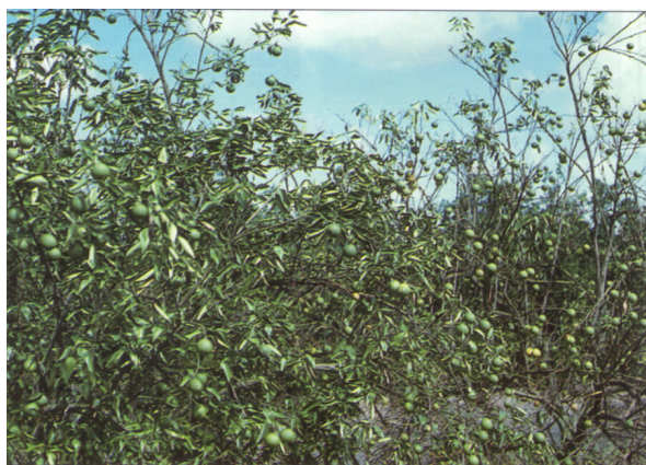
Figure 4. Early symptoms of water damage showing foliage discoloration, wilt, plus leaf and fruit drop.

Symptom expression of damage may occur over a period of time depending on the severity of root damage. Symptoms usually start to show up after the water table drops and the soil dries out. Root damage symptoms include leaf yellowing, chlorosis, wilting, fruit drop, leaf drop, and dieback (Fig. 4). Often root damage is so severe that trees may go into a wilt even though water furrows are still wet (Fig. 5). Because the root system was pruned by the flooding, the full extent of damage may not be known for several months or until drought conditions occur.