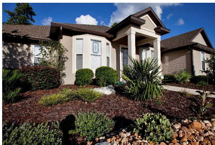
Figure 1. A Florida Friendly Yard in NW Gainesville, Florida.

Recently, consumers have become more interested in sustainable gardening and landscaping, especially if they are able to do it themselves. Florida-Friendly Landscapes (FFL) is a program unique to Florida that encourages the installation of sustainable landscapes that require fewer inputs, use less water, attract more wildlife, and are better for the environment (Florida-Friendly Landscaping 2014; Hansen et al. 2015). Florida-Friendly landscapes require little to no special equipment and can easily be completed by the everyday homeowner. Encouraging homeowners to install FFL and use FFL practices could reduce water pollution (Hansen et al. 2015). Encouraging Florida homeowners to use FFL could improve Florida's environment.