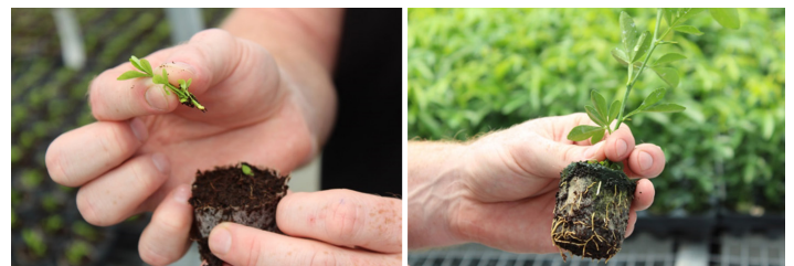
Figure 4. Left: Tissue-culture-generated shoots placed into potting medium for rooting. Right: Young tissue-culture-generated rootstock seedling several weeks after rooting.

After an elongation phase, clusters are separated into individual shoots (Figure 3). Depending on the preference of the nursery, individual plants are rooted on agar medium before transplanting, or they are directly rooted into potting medium (Figure 4). After an acclimatization period under high humidity conditions, roots will develop and the young