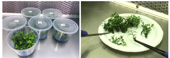
Figure 3. Left: Shoot clusters generated on agar nutrient medium in a sterile environment. Right: Separation of shoot clusters into individual shoots for rooting.