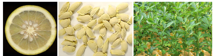
Figure 1. Citrus rootstock fruit (left), extracted dried seeds (center) and young rootstock seedlings (right).

Historically, rootstock liners have been produced almost exclusively from apomictic seed (Figure 1). Other propagation methods, specifically by cuttings and tissue culture (micropropagation), are relevant for several reasons: 1) some rootstock germplasm does not produce sufficient seed; 2) some rootstock germplasm never or infrequently produces nucellar seed; 3) for some rootstock germplasm, no or few seed-source trees are available; and 4) the industry demand for specific superior rootstock germplasm exceeds the available supply. The latter is specifically relevant in the current era of HLB (huanglongbing, a.k.a. citrus greening).