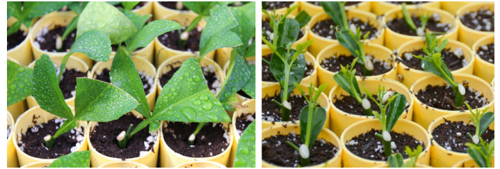
Figure 2. Freshly cut single internodes placed in potting mix with leaf blade attached but reduced in size. Right: Young rootstock sprouts growing from the buds of the internodes. Leaf blades are removed for better visualization.

made it possible to economically produce large numbers of genetically identical plants from most rootstock selections. The starting material for establishing micropropagated plants varies depending on the preference of the nursery and can consist of nucellar embryos, stems, or buds, all of which must be derived from disease-free foundation trees. The explants are placed in a nutrient agar medium, which may contain a small amount of growth regulators to