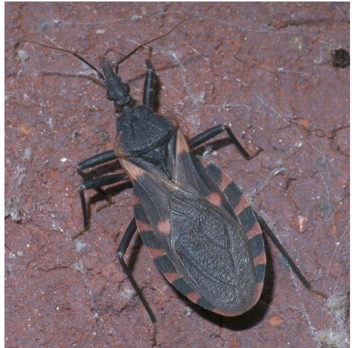
Figure 4. Triatoma sanguisuga , the eastern bloodsucking conenose. This species, among others, are vectors of Chagas disease.

bloodsucking conenose is one such species. Triatomine insects are found in much of the United States but are more common in southern regions. Formerly a disease of rural Latin America, Chagas disease has spread to cities in the southern United States and is now recognized as an emerging disease there. An estimated 8 million people are infected worldwide, with 20% to 30% potentially developing life threatening complications. There are cases of Chagas disease being spread through human blood transfusion, organ donation, and birth, but no documented cases directly from vertebrate animals. Blood screening for Chagas disease began in 2007, leading to an increase in known prevalence in the United States; however the majority of cases are in Latin America.