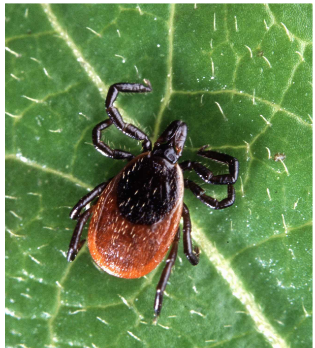
Figure 7. Blacklegged or deer tick Ixodes scapularis