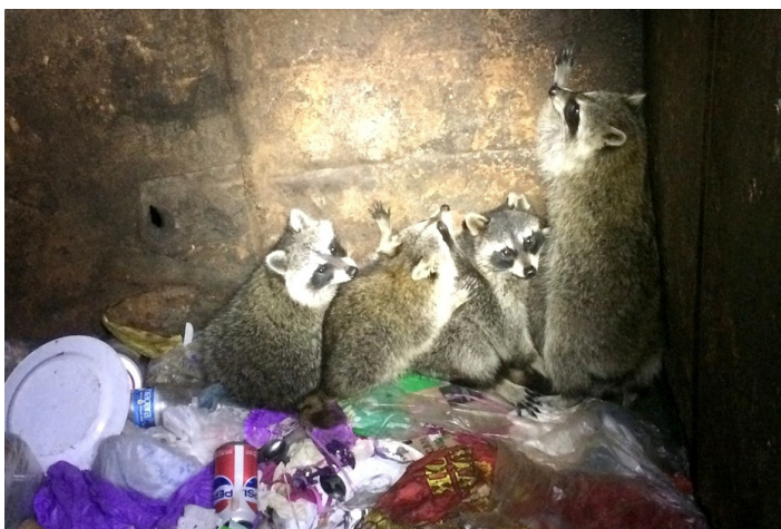
Figure 5. A group (gaze) of five raccoons in a dumpster, a common gathering spot.

Raccoon-borne diseases pose a significant threat to humans, wildlife, zoo animals, livestock, and pets. With knowledge and simple measures, we can avoid these hazards and be proactive in treatment. Most problems arise when people attract raccoons intentionally or unintentionally. When treated with respect and caution, raccoons can live near humans as an interesting part of the urban ecosystem.