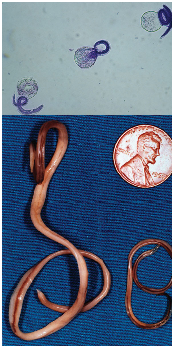
Figure 2. Larvae (top, magnification \times 40 ) and adults (bottom) Baylisascaris procyonis . Adult females (bottom left) are about 20–24 cm long; males (bottom right) are about 9–12 cm long.

body. Raccoons are the natural definitive host, in which B. procyonis larvae develop into adults in the small intestine and reproduce to complete the life cycle. Young raccoons have a higher rate of infection than adults. B. procyonis in raccoons reaches highest densities in raccoons in the Midwest, Northeast and West Coast of North America (Figure 3). The Southeast United States was considered low risk, but recent cases of clinical and asymptomatic infection have emerged, including in Florida. Further details can be found in a dedicated document about the raccoon roundworm .