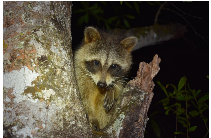
Figure 1. A juvenile raccoon in a tree in Broward County, south Florida.