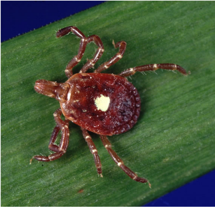
Figure 8. Lone star tick Amblyomma americanum