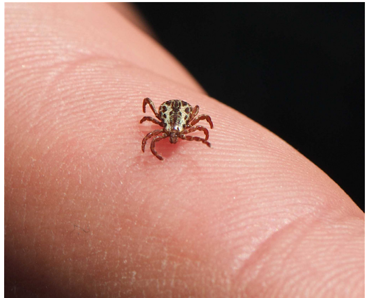
Figure 6. American dog tick Dermacentor variabilis